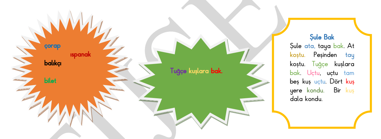
Figure 7. Reading cards

During the component education studies, teachers draw attention to the formations by forming syllables/words/sentences. Besides, after determining the vocals which the children have problems reading-writing; the syllables, words and sentences in which these structures are repeated are formed and the children are made to read and write them. All the structures that are formed during these practices are hung on the "syllable-word-sentence" boards (Figure 7).