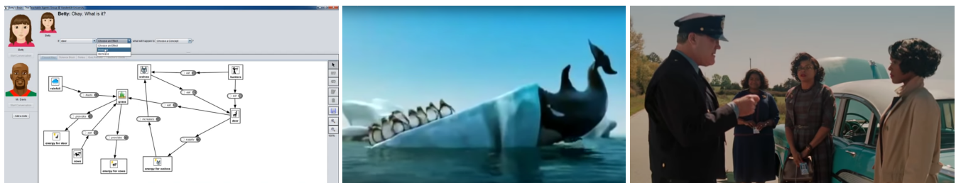
Figure 1: Screenshots of activities in our usability study. Left: A one-hour module on forest ecosystems from the Betty's Brain science education technology (Leelawong & Biswas, 2008). Center and right: TV/movie clips from our social-reasoning QA activity, including animated (e.g., Cooperation short film) and live-action (e.g., Hidden Figures ) clips; Table 2 lists all clips.

Here, we study usability and engagement as part of a formative, user-centered design process in a larger project that aims to translate the Betty's Brain science education system (Leelawong & Biswas, 2008), designed and used to date for typically developing middle school students in general classroom environments, into a new intervention for teaching the-