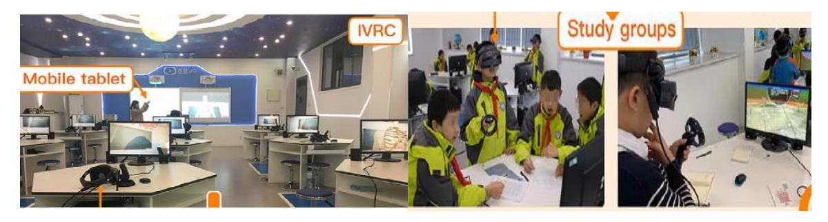
Figure 3. Immersive VR Classroom (IVRC) in a middle school in China

Liu (2020) researched on an Immersive VR Classroom (IVRC) in a middle school in China, whereby each student desk comes with a complete VR headset with tablet and screen. The immersive VR classroom students showed better science achievement compared to traditional teaching methods of using slides and video. The VR group showed better engagement in cognitive, behavioural, emotional, social domains. The research noted the importance of complementing IVRC with collaborative learning activities. See Figure 3.