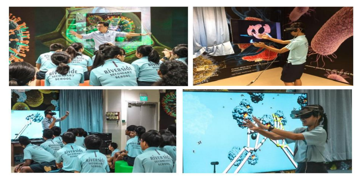
Figure 4. Immersive VR lessons in the science curriculum, Riverside Secondary School