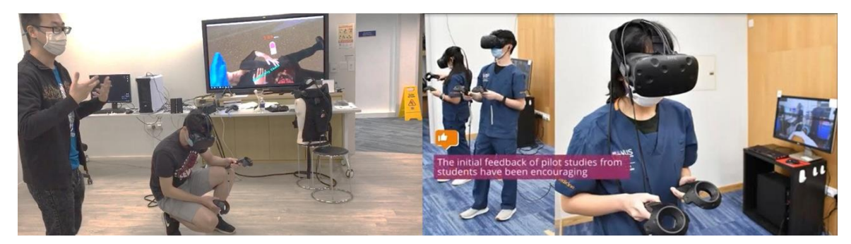
Figure 1. Vise immersive VR software used to train medical students

Immersive VR is a powerful tool for students can apply their scientific knowledge in realistic settings and increase transfer of learning to the real world. This is due to better generalisation of learning, which occurs when there is increased similarity between training and real-world tasks (Schultheis and Rizzo, 2001). An immersive VR software called VISE developed by Keio-NUS (National University of Singapore) CUTE Centre enables medical students to practice the skills of responding and handling patients injured in an emergency scenario (NUS, 2019). VR controllers are used to assess the conditions of casualties be it excessive bleeding, wound or even death. The simulation allows medical students to familiarise with the triage methodology process by going through the actual motions of assessing casualties (Figure 1).