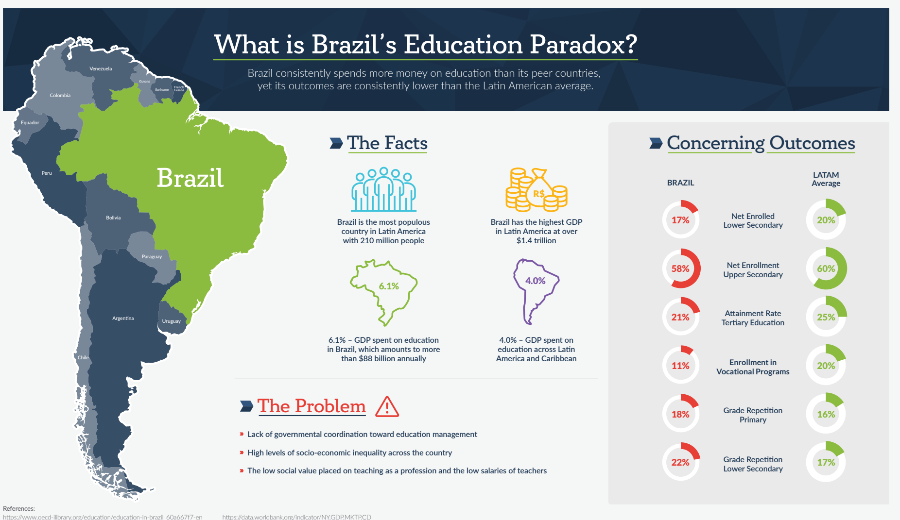
FIGURE 4. Brazil's Education Paradox

https://fred.stlouisfed.org/series/SIPOVGINIBR