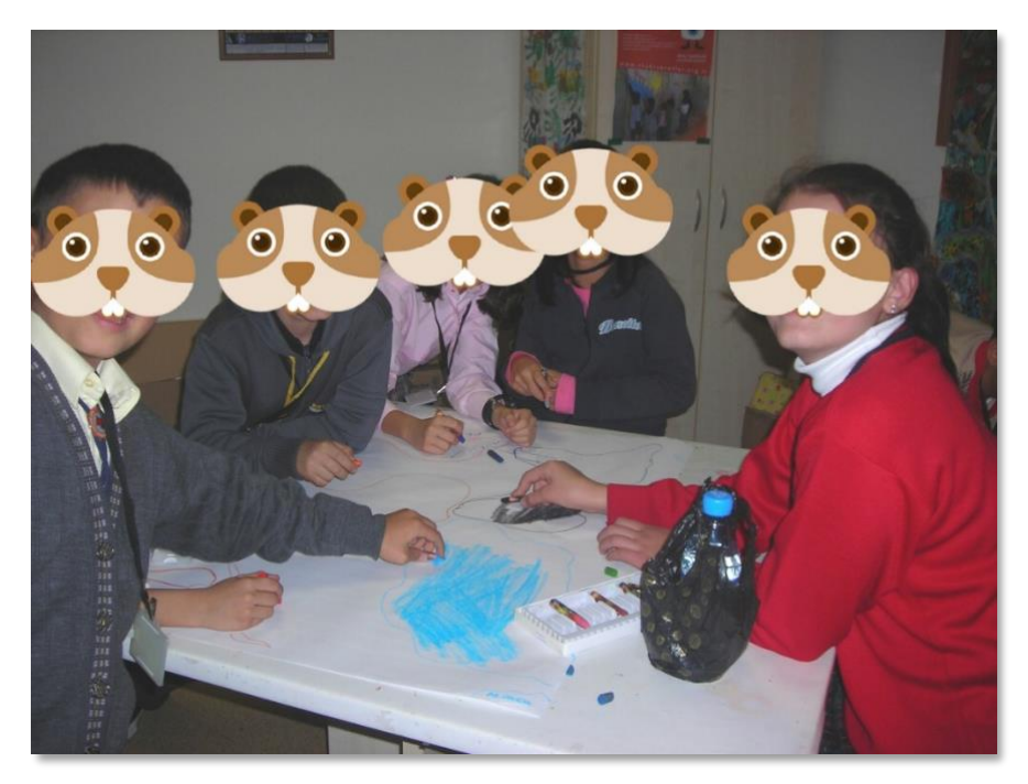
Figure 5. Students are Preparing the Project after They have Distributed the Tasks

Students who benefit from their imagination and creativity after seeing the map for a very short time are expected to use the drawing paper proportionately and complete their project in the assigned duration. (Figure 6)