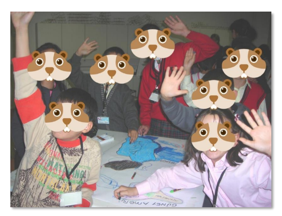
Figure 6. A Group of Students who are about to Finish Their Tasks at the Assigned Time

Students who benefit from their imagination and creativity after seeing the map for a very short time are expected to use the drawing paper proportionately and complete their project in the assigned duration. (Figure 6)