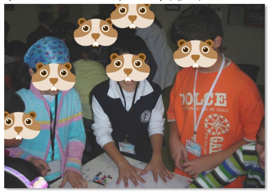
Figure 4. Distribution of Roles which is Conducted by Students in Communication and Collaboration with Each Other

d) It is announced that all groups have 25 minutes to complete the task.