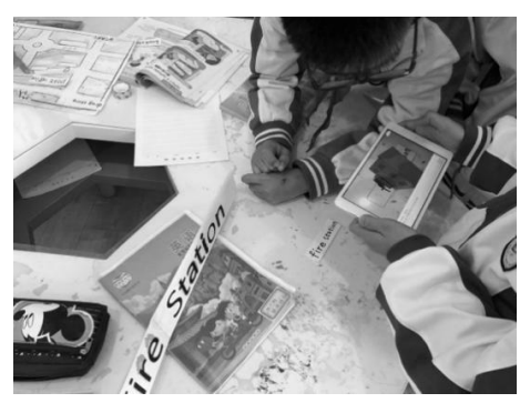
Figure 3. Cooperating in groups

Students of two parallel classes in the 4th Grade took part in this study, 35 of them divided into the experimental group and 32 into the control group. The experimental group cooperated to learn with handwriting recognition AR application as shown in Figure 3, while the control group learning by analyzing the materials and discussing with the group instead.