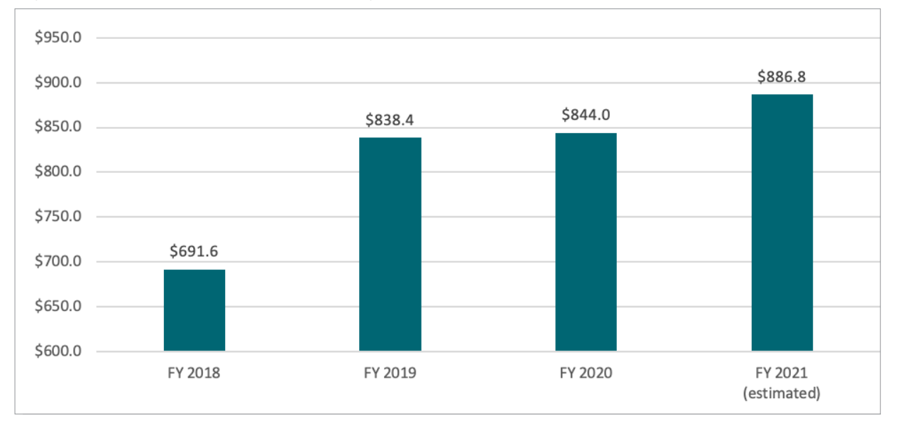
Figure 4. Department Total IT Spending FY 2017–2020 (Dollars in Millions)