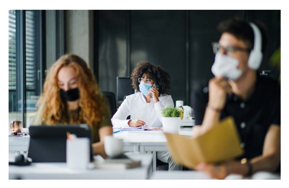
Duplicate HEER Fund Awards —Determine the extent to which the Office of Postsecondary Education has awarded duplicative HEER Fund awards in the G5 system.

Schools' Use of HEER Funds: Grants to Eligible Students and Use of Institutional Portion—Determine whether selected institutions of higher education used the Student Aid and Institutional portions of their HEER funds for allowable and intended purposes. We issued a report to Lincoln College of Technology (A20CA0016) and Remington College (A20CA0017). We are planning work at a school to be determined.