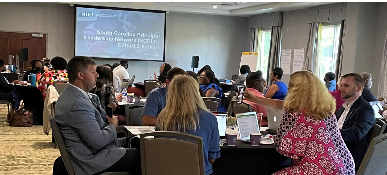
Cohort 2 SCPLN school leaders met for a two-day summer kickoff meeting.

of surveyed SCPLN school leaders indicate that coaching sessions allowed them to apply the information they learned during the NIET Principal Leadership Series training.