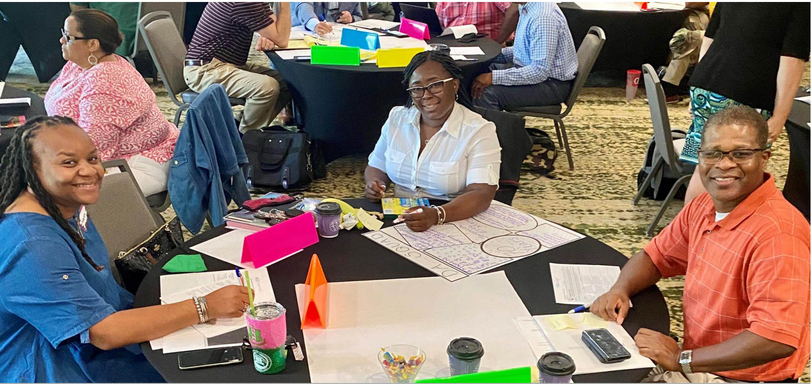
Cohort 2 SCPLN school leaders worked together during the summer kickoff meeting.