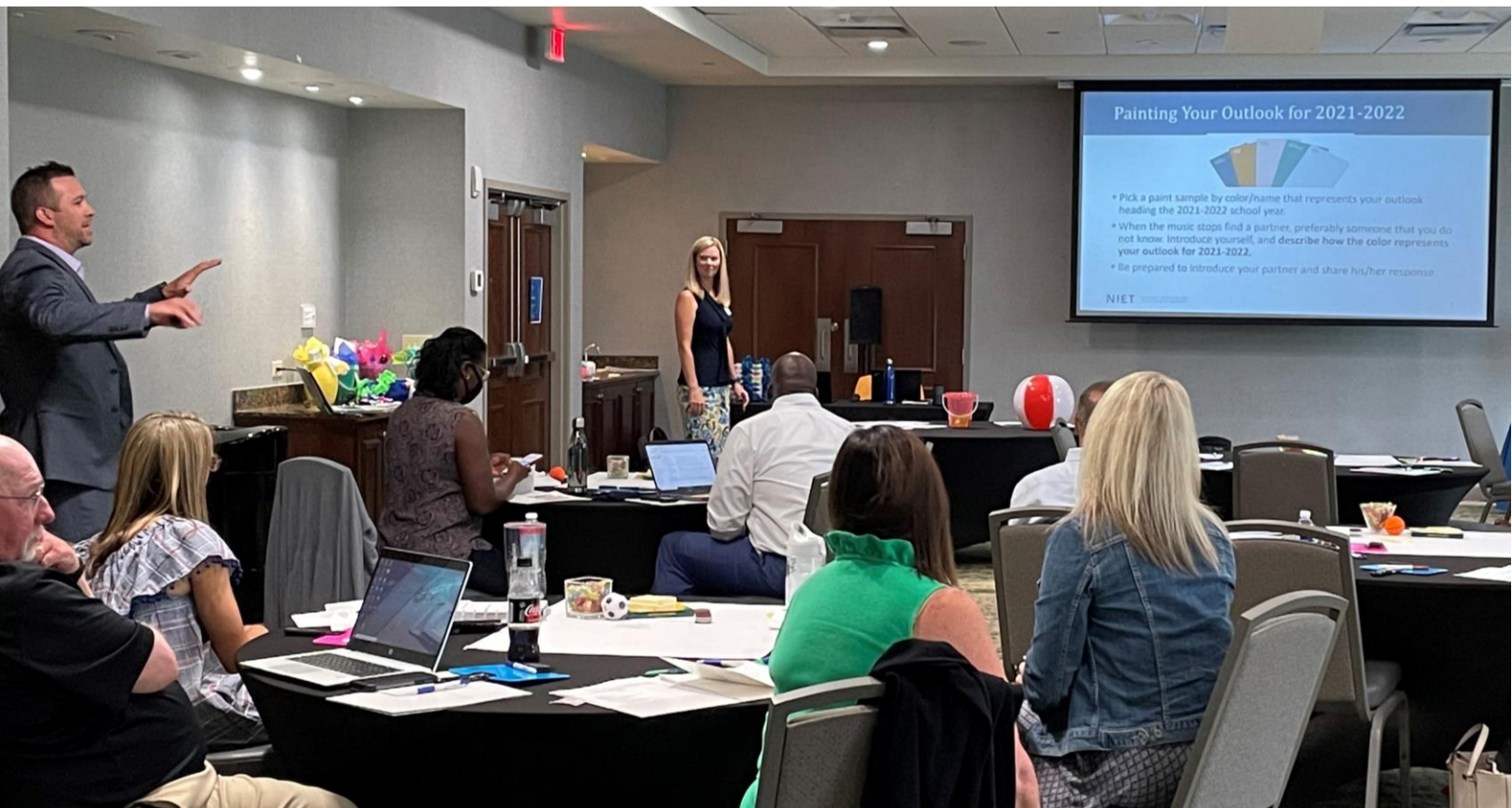
During summer 2021, NIET senior specialists led training for more than 100 SCPLN school leaders.