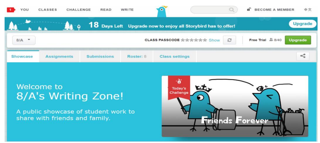
Figure 1: Storybird as a digital storytelling tool

The researcher decides on the Storybird website to generate digital stories. The major ground using this website is that Storybird has a very handy interface and it provides great visuals to its users. Although the website is not free of charge, 30 days are allocated as a trial period and it is quite sufficient for the realization of the study. Also, a free assignment 'Friends Forever' is elected by the researcher as an authentic implementation in an English classroom would be in that way.