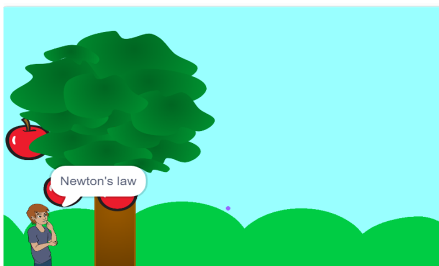
Figure 2. Screen shoot of physics scratch project.

A sample of the physics project (newton law), the link is https://scratch.mit.edu/projects/631667157/ , and the screen shoot in Figure 2.