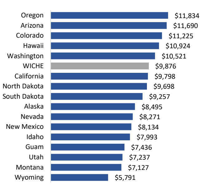
Figure 2. State Average Resident Tuition and Fees at Four-Year Institutions, Weighted, 2020-21

• Similar to the regional average rate of change, seven states reported their lowest annual change in tuition and fees in the past decade.