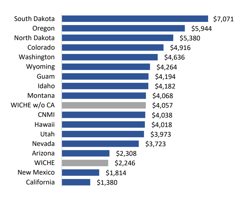
Figure 4. State Average In-District Tuition and Fees at Two-Year Institutions, Weighted, 2020-21

As stated previously, the moderate increase in regional average tuition and fees over the past year was the lowest rate of change over the past decade, which signals a positive trend in postsecondary prices in the region. However, it is important to note that in many cases tuition and fees were decided upon in a different pre-COVID landscape. As discussed in the May 2020 WICHE Insights, <u>Tuition and Fees, Appropriations, and Financial Aid in</u> <u>the West: Strategic Alignment in Time of Uncertainty</u>, the economic impacts of COVID-19 are expected to be significant on state budgets and the upcoming legislative sessions could prove to have a more significant impact on tuition and fees rates in the upcoming academic year. Historically speaking, periods of economic downturn often coincide with decreases in state fiscal support for higher education and increases in tuition and fees which