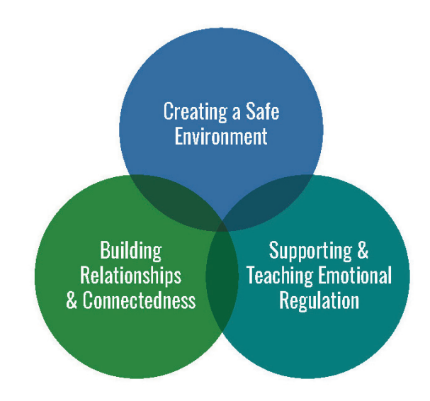
Figure 5. Components for a TI school