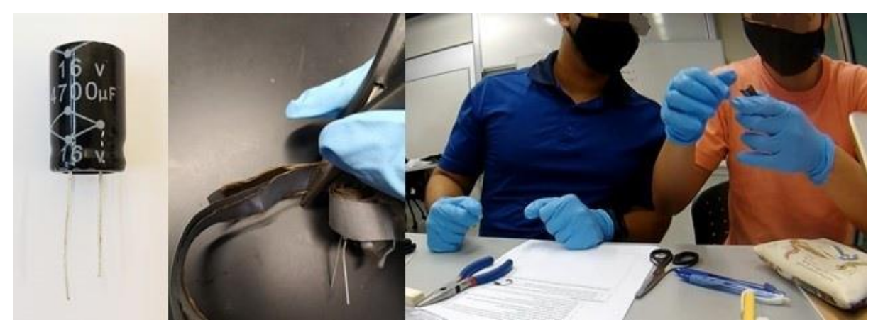
Figure 2 The dissection of aluminium electrolytic capacitor.