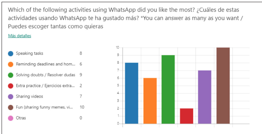
Figure 3. Students' preferences of activities

When they were asked which activity they had found the most useful, the majority mentioned that it was the speaking tasks and sharing videos, followed by the fact that doubts (grammar, deadlines, homework, and so on) were solved very quickly.