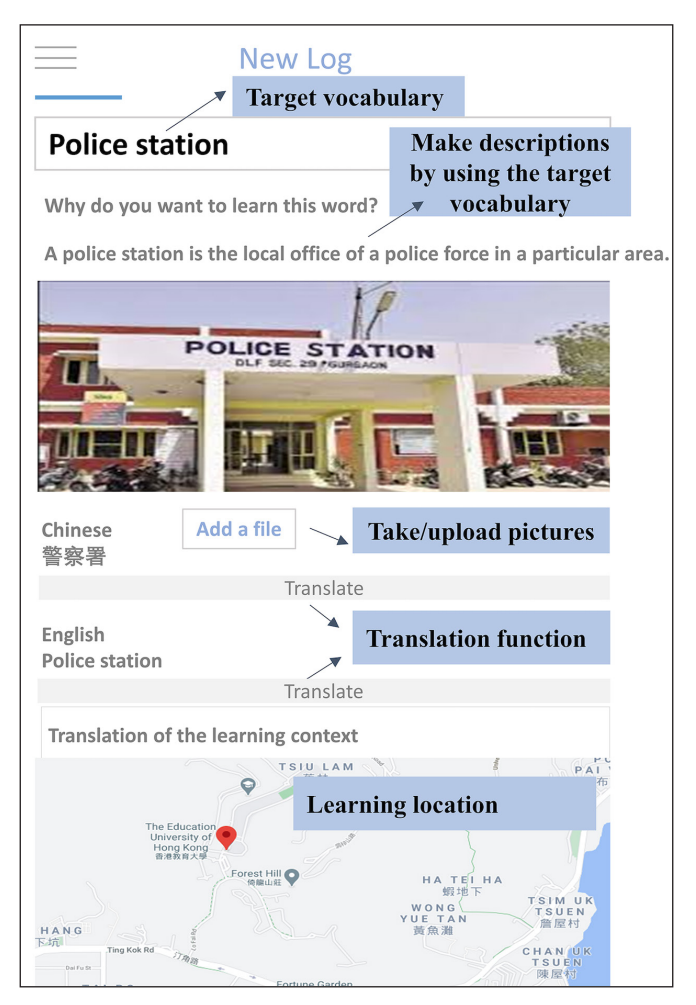
Figure 1. Interface of a 'learning log' on the m-UGC tool

Data collection included students' vocabulary learning logs recorded on the m-UGC tool and two groups' pre-and post-vocabulary tests and surveys. A motivation questionnaire with 24 items was adapted from Wu's (2018) study. Responses were given on a five-point Likert scale, ranging from one for 'never' to five for 'always'. Quantitative data analysis was used with the assistance of SPSS version 25. Independent t-test was adopted to analyse the vocabulary achievement between two groups. With regard to learning motivation, a paired t-test was adopted. In addition, students' vocabulary learning logs were used as evidence to triangulate the data.