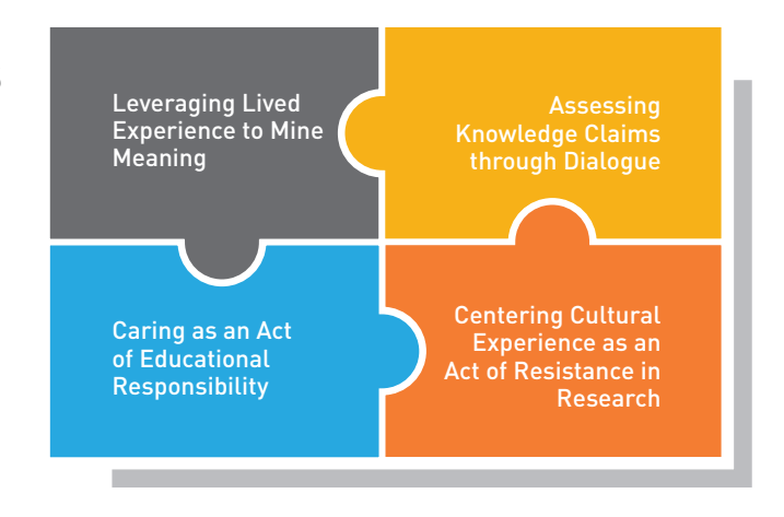
FIGURE 3 FOUR THEORETICAL PRINCIPLES GROUNDING UNCF PRACTICES IN PEDAGOGY