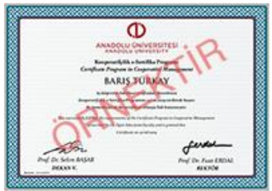
Figure 4. Certificate of Cooperative

The last step of the Cooperative e-Certificate Program is the exam and it is carried out three times in 81 provinces with online supervision. During the enrollment to the program, the students are asked to choose the exam center and determine in which province they would like to take the exam. The examination organization is done by Anadolu University and is conducted either in computer labs of agreed universities all around Turkey under the supervision of someone in charge or online. Students are expected to get 50 points out of 100 points to be regarded as successful. Those with a score of 50 and above are entitled to receive a "Cooperative Certificate". 5 days after the exam, the "Exam Result" demonstrating the success of the candidates is published online and the printed certificates are sent to the students by mail (Figure 4). Exam results are also reported to the General Directorate of Cooperatives, the Ministry of Trade.