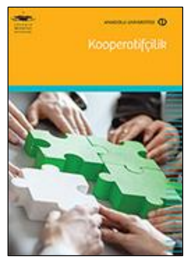
Figure 1. Cooperative Textbook

Participants who enroll in the Cooperative e-Certificate Program prepare for the certification exam by using the printed textbook designed according to the distance learning methods, watching the lessons conducted online and using e-learning materials designed according to the self-study methods, sent to them by mail for 12 weeks.