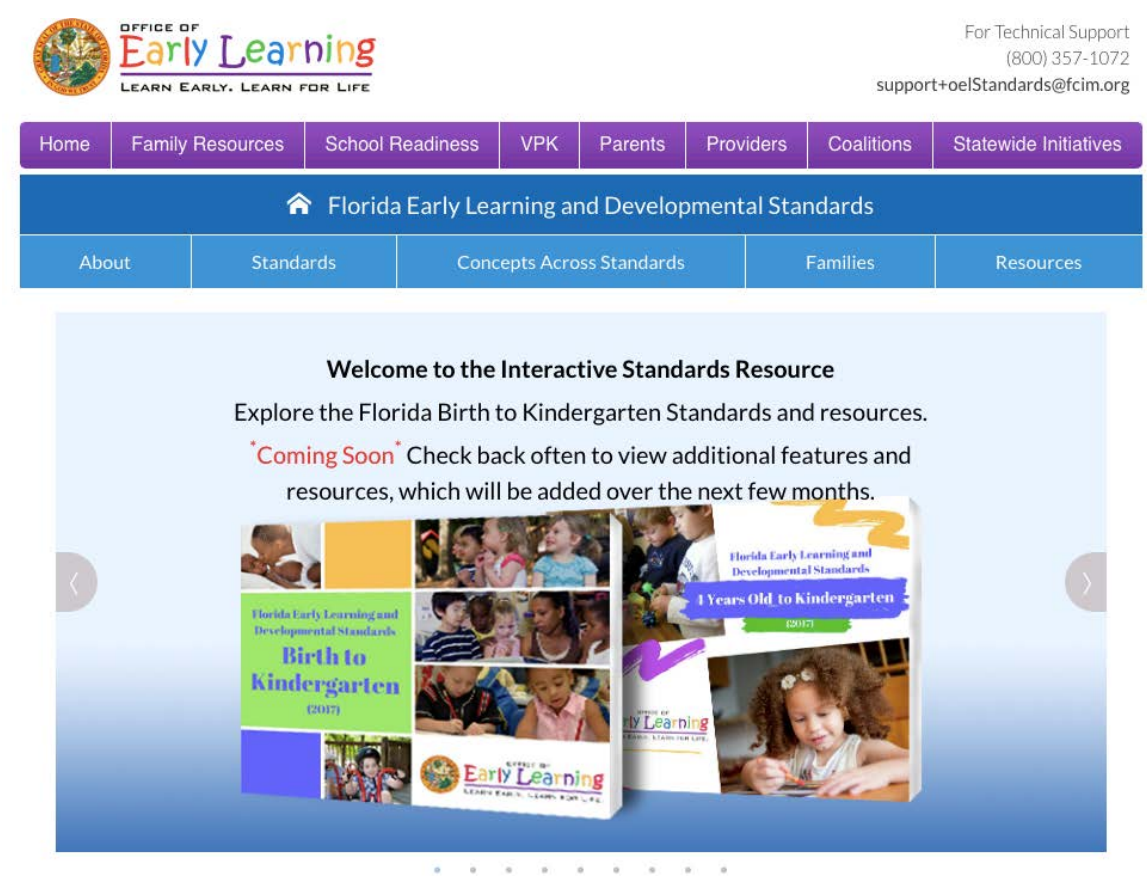
Figure 1. Landing page for the Florida Early Learning and Development Standards.

In Florida, users can access a range of downloadable and interactive features to support the state Birth to Kindergarten Standards (see Figure 1):