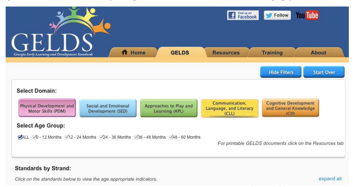
Figure 3. Georgia Early Learning and Development Standards (GELDS) landing page.

In Georgia, users can access the Georgia Early Learning and Development Standards (GELDS – <a href="http://gelds.decal.ga.gov/Default.aspx">http://gelds.decal.ga.gov/Default.aspx</a>) using an easily understood landing page that allows users to select specific standards to access (see Figure 3 for a screen shot of the GELDS page).