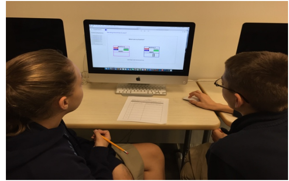
Figure 3. Students working on the applet

A second version of the Vending Machine task was designed specifically for secondary students (Design Principle 1). It was designed to be used as an introduction to function with students who had no previous experience with the term function . The goal of this version of the task is that students develop a definition of function based on their exploration of the machines in the applet. The applet was then implemented in an 8th grade math class with pairs of students working together and their work on the task was screen captured. Next, the students' videos were analyzed for the purpose of selecting examples of work. This included identifying video clips for episodes of confusion or surprise, followed by the analysis of the window, depth of student thinking, and clarity of student thinking (Design Principle 2 & 3). Once video episodes were selected, they were packaged as a case with questions designed based on Jacobs et al. (2010) professional noticing construct (Design Principle 5). For example, PSMTs were asked to attend to and interpret the coordination of student thinking and technological actions when analyzing the video cases. Further, they were asked to make predictions about student thinking and