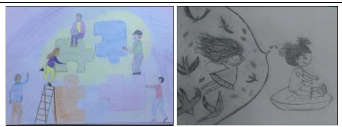
Picture 1: Pictures drawn by students for Photos, Caricatures and Pictures Practice