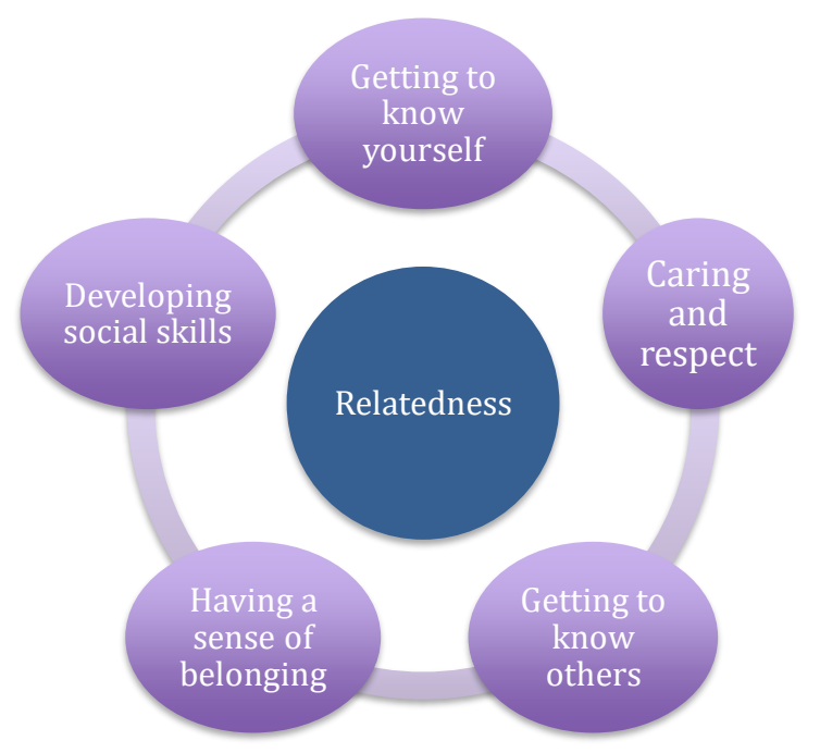
Figure 4: Final results about relatedness

In this study, which was carried out in order to develop the competencies related to the relatedness of students who think that they have problems in the context of social relations and to investigate the students' sense of belonging, it was seen that the students developed positive thoughts about relatedness and belonging. Thanks to the relatedness practices the students realized their behaviors that they thought caused social problems.