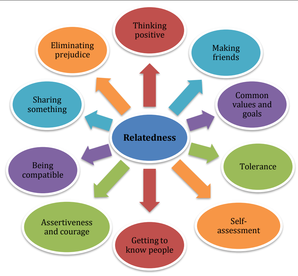
Figure 2: Categories related to relatedness

The students in the study group were asked about how they behaved in the past related to social relations. The students were asked to evaluate the positive situations they experienced in relation to healthy relationships by comparing them with their previous experiences. The students explained that in the past, they did not care about the effective ways of communication they realized through practices, moreover they did the opposite of what they learned today in the past.