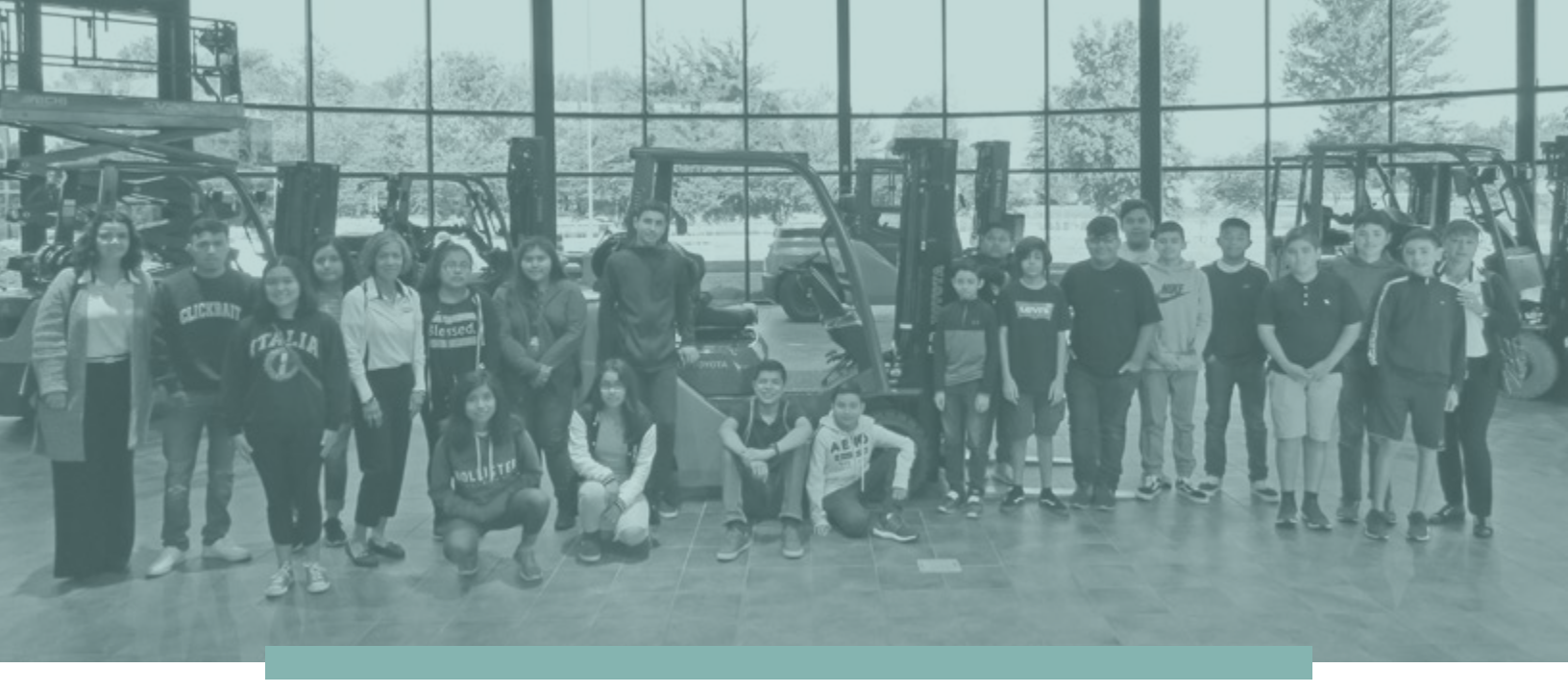
Middle and high school Latinx students visit the Toyota plant in Columbus, seeing not only the manufacturing process, but also future career opportunities.

The process is modeled on a system-building, relationship-based approach as opposed to a problemsolving, resource-based approach. Those two things are fundamentally different. The resource-based approach is always a deficit-based approach and is almost always based on a scarcity model. When you use resources, they're forever expended, but a relationship-based approach is just the opposite. The latter is like a muscle. The more you engage the relationship and the more you use it, the stronger it becomes.