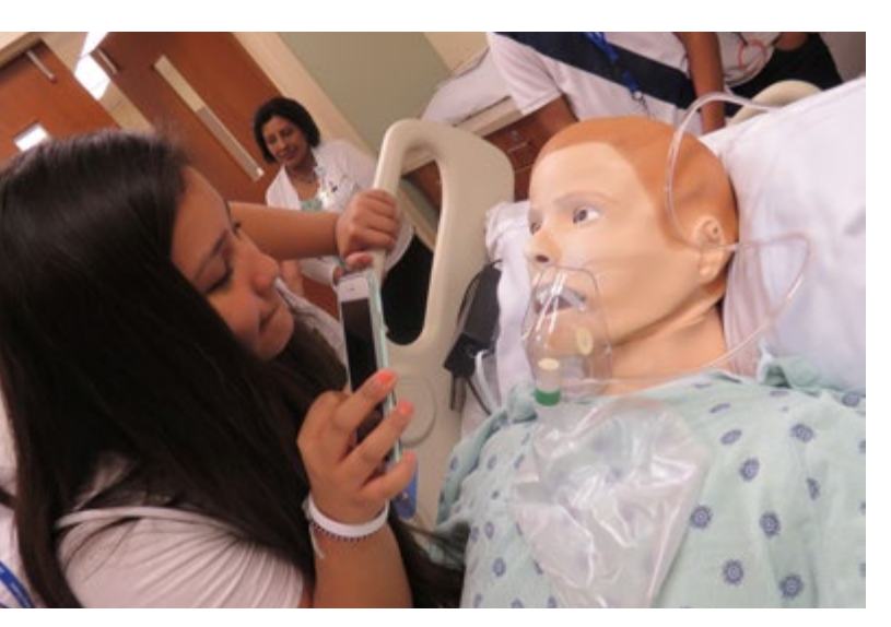
Latinx students learn about career paths in health at the Columbus Regional Hospital.

Community Education Coalition – We try to help groups focus on changing economic opportunities related to occupations and skills in different sectors. Identifying what skillsets are required to work now and in the future is a helpful starting place to engage folks through the Stakeholder Engagement Process. When groups engage through the process, we ask them to define their community challenge as a question instead of a statement.