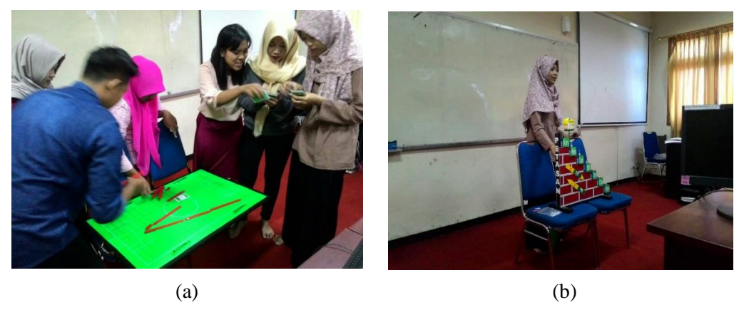
Figure 5. Use of learning media on the implementation of learning (do)

Also, at the beginning of the microteaching lesson study, the students were also able to use the learning media well. This is shown in Figure 5.