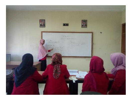
Figure 4. Learning activity (do)

Also, at the beginning of the microteaching lesson study, the students were also able to use the learning media well. This is shown in Figure 5.