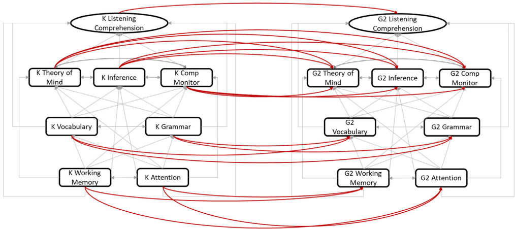
Fig. 3. Longitudinal prediction of language and cognitive skills. Those in red are longitudinal paths, whereas those in gray are cross-sectional paths. K, kindergarten; G2, Grade 2. (For interpretation of the references to color in this figure legend, the reader is referred to the Web version of this article.)

Model fit was evaluated by the chi-square statistic, comparative fit index (CFI), root mean square error of approximation (RMSEA), and standardized root mean square residual (SRMR). Typically, RMSEA values below .08, CFI values equal to or greater than .95, and SRMR values equal to or less than .05 indicate an excellent model fit. CFI values greater than .90 are considered to be good, and RMSEA values greater than .10 indicate a poor fit (Kline, 2005). Model fits for nested models (i.e., the four alternative models described above) were compared using chi-square difference tests.