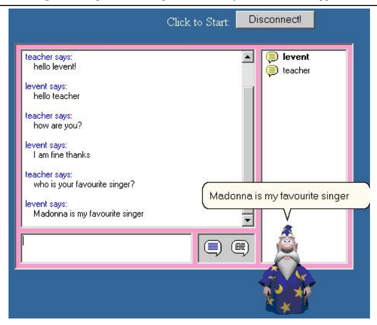
Figure 4. Chat page of the web-based learning tool.

Microsoft agent (MS-Agent): Microsoft Agent technology is defined as "a software technology that enables an enriched form of user interaction that can make using and learning to use a computer, easier and more natural" (Microsoft Agent Home, 2003, ¶ 1). By using MS-Agent technology animated characters could be embedded into applications such as web pages. These animated characters can speak (text-to-speech engine) and also accept spoken commands (speech recognition). Official Microsoft Agent site clearly states that developing and using MS-Agent is totally free (Microsoft Agent Home, 2003).