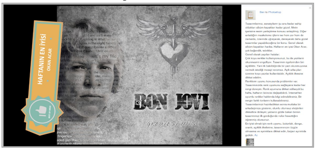
Figure 4: Best of week

The teacher assessed all the assignments on the system, rewarded successful students with virtual badges, and shared the profile of the best weekly student on the main page.