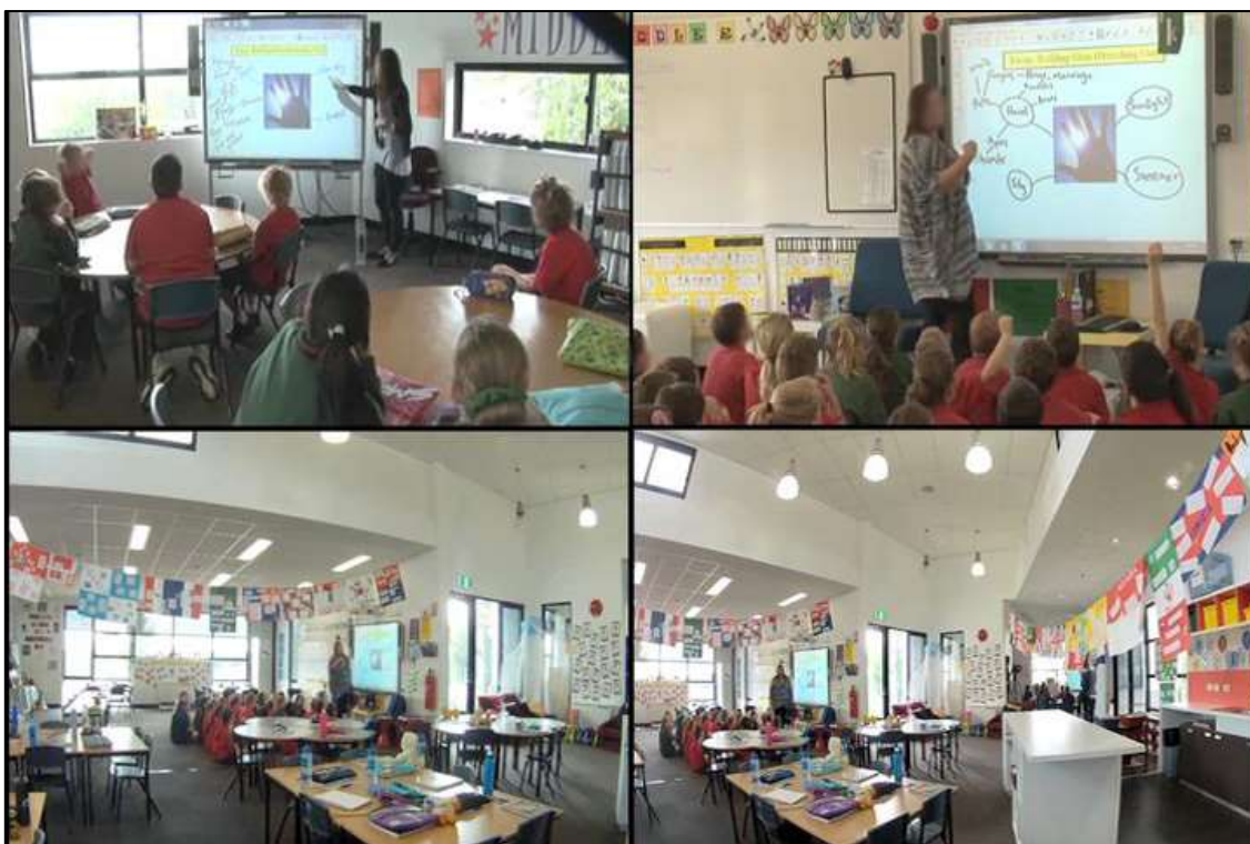
Figure 7. Content instruction at Balliang PS (at 6 min 40 sec.)