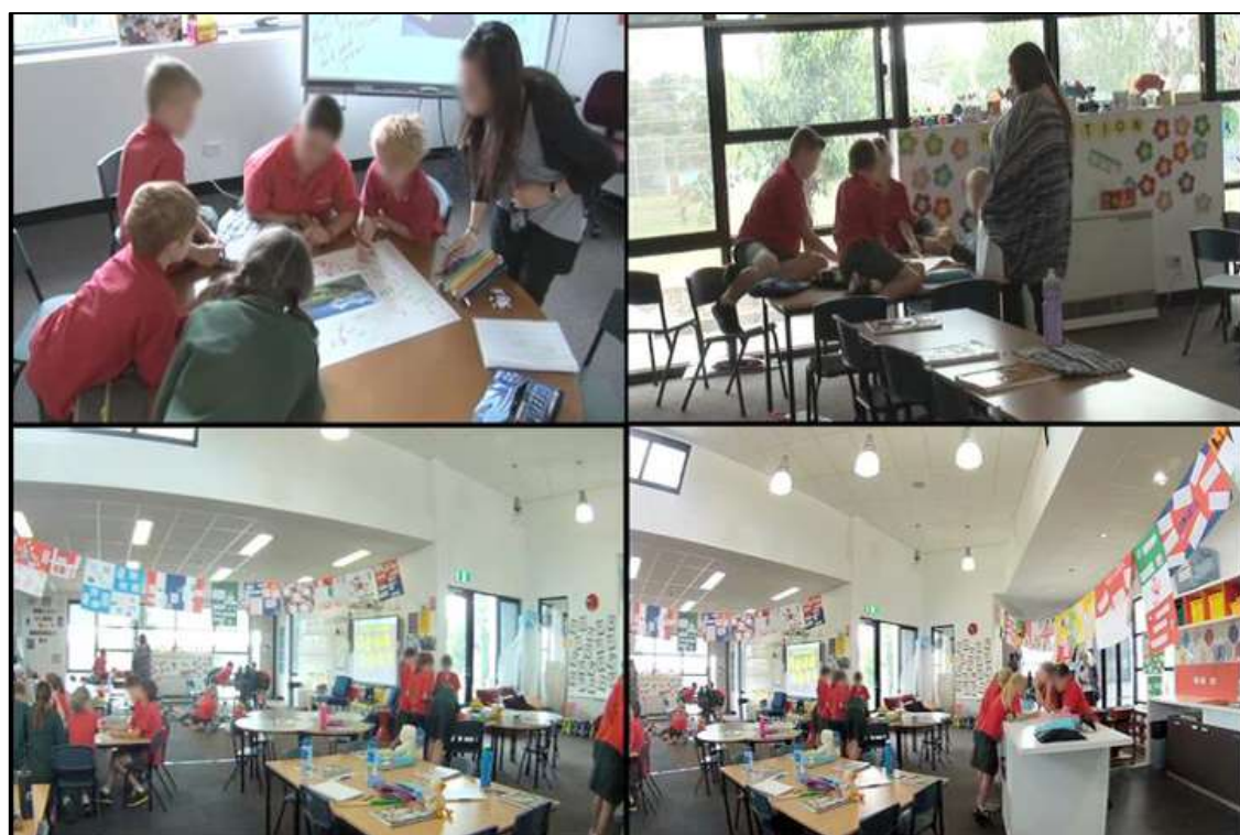
Figure 8. Conferencing at Balliang PS (at 25 min 45 sec)