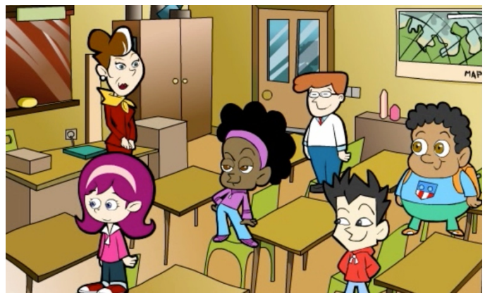
Figure 1. Goanimate screenshot example.

In Phase One, we created a task to provide insight into PSTs' noticing that could be administered in each of the six methods courses. We showed the PSTs a video clip from a mathematics classroom that featured a student-centered classroom and included segments of elementary students sharing their mathematical thinking. We used the publicly available video, Cookies to Share , (<u>http://www.learner.org/resources/series32.html</u>). The PSTs were required to watch the clip (beginning to 13:45) in class, identify a pivotal moment of student(s)' mathematical thinking specific to mathematical learning or teaching, and then record this moment in writing. After writing about what they noticed, preservice teaches created their own scenes of the most pivotal moment they noticed using the website, goanimate.com. Goanimate is a cloud-based platform for generating and disseminating animated videos. Figure 1 is a screenshot of an animation. The intent of this design was to provide opportunities for PSTs to communicate what they noticed from the video through written and animated mediums.