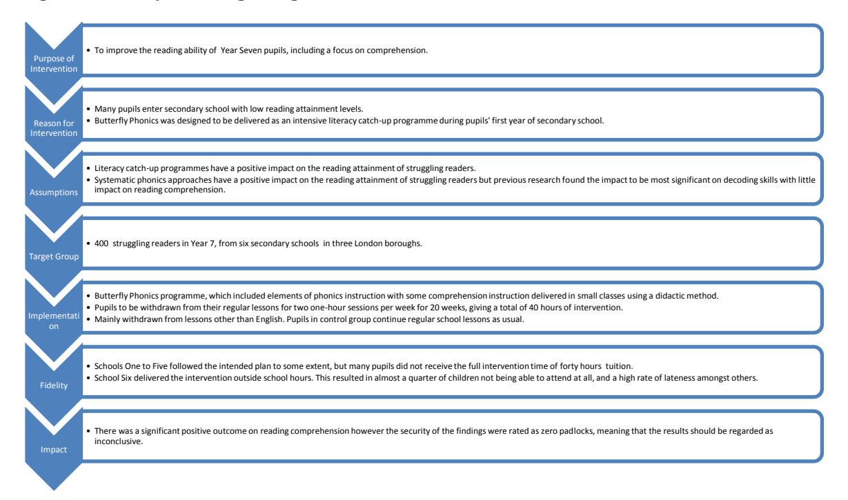
Figure 2: Theory of change diagram

The intention-to-treat analysis of the primary outcome measure suggested a significant and positive effect for Butterfly Phonics; however, the level of attrition in addition to the reported implementation and test administration issues should be borne in mind. Additionally, when clustering was taken into account, the positive impact was promising but inconclusive. The secondary outcome measures suggested a beneficial impact, however, these results were not statistically significant.