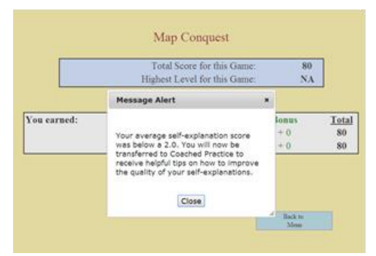
Fig 3. Performance threshold pop-up notification

Self-Assessment. The self-assessment feature was designed to encourage local metacognition. After each self-explanation, the participant was prompted to predict the quality of the self-explanation as poor , fair , good , or great (again reflected numerically as 0-3) and to rate their confidence in this prediction on the same scale. After making this selection, participants were given the actual self-explanation score.