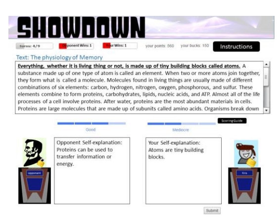
Fig. 2 Showdown

More pertinent to the current study are the generative practice games . In these two games, Map Conquest and Showdown , students construct their own self-explanations. In Showdown , for example, the student competes against a computer opponent to construct the best self-explanation (Fig. 2).