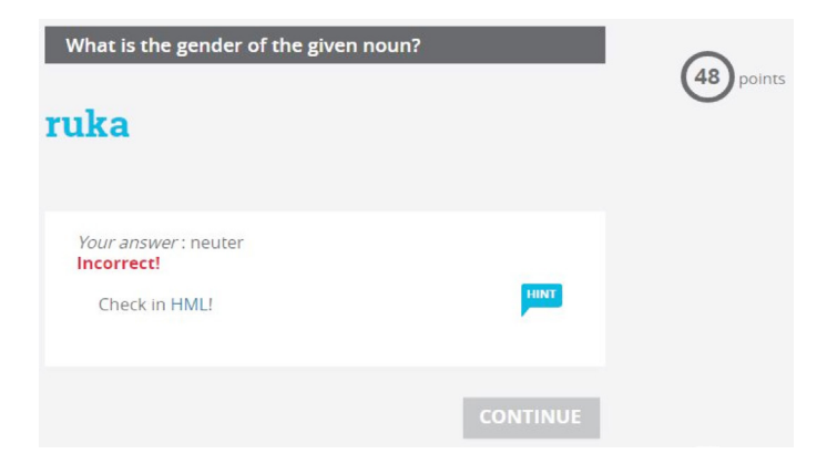
Figure 3. Using LRs in courses

The section dedicated to language resources provides users with the introduction to the Croatian LRs: Croatian National Corpus (hnk.ffzg.hr), Croatian Morphological Lexicon (hml.ffzg.hr), Croatian Wordnet (crown.ffzg.hr), Croatian Dependency Treebank (hobs.ffzg.hr), and CroDeriV – Croatian Derivational Lexicon (croderiv.ffzg.hr). These resources can be useful when learning Croatian and are used as helpful tools (so-called – HINT, cf. Figure 3) in completing assignments throughout the HR4EU courses. The section also includes a short video-tutorial for each resource and a link to the respective search interface.