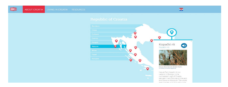
Figure 2. Section About Croatia

The section About Croatia provides the cultural context for learning Croatian via nine interactive maps: borders, cities, culture, events, people, nature, wine, food, and recipes. By clicking the pins on the maps, pop-up windows appear and users can read about peculiarities related to the part of Croatia where the pin is located (cf. Figure 2).