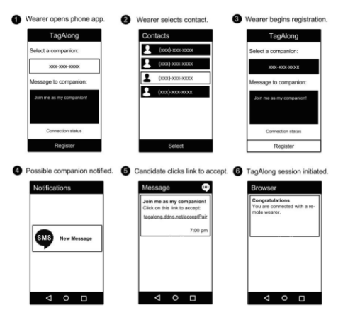
Figure 2. Interaction Initiation Flow