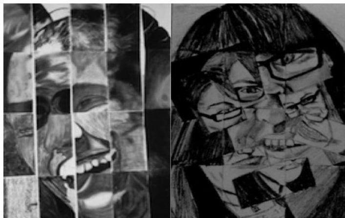
Figure 9. Students employed a drawing medium in their explorations of “personal identity”.

In the following example from Student D (see Figure 9), the focus of the exercise was to explore the concept of personal identity using a photomontage technique developed by the artist David Hockney: