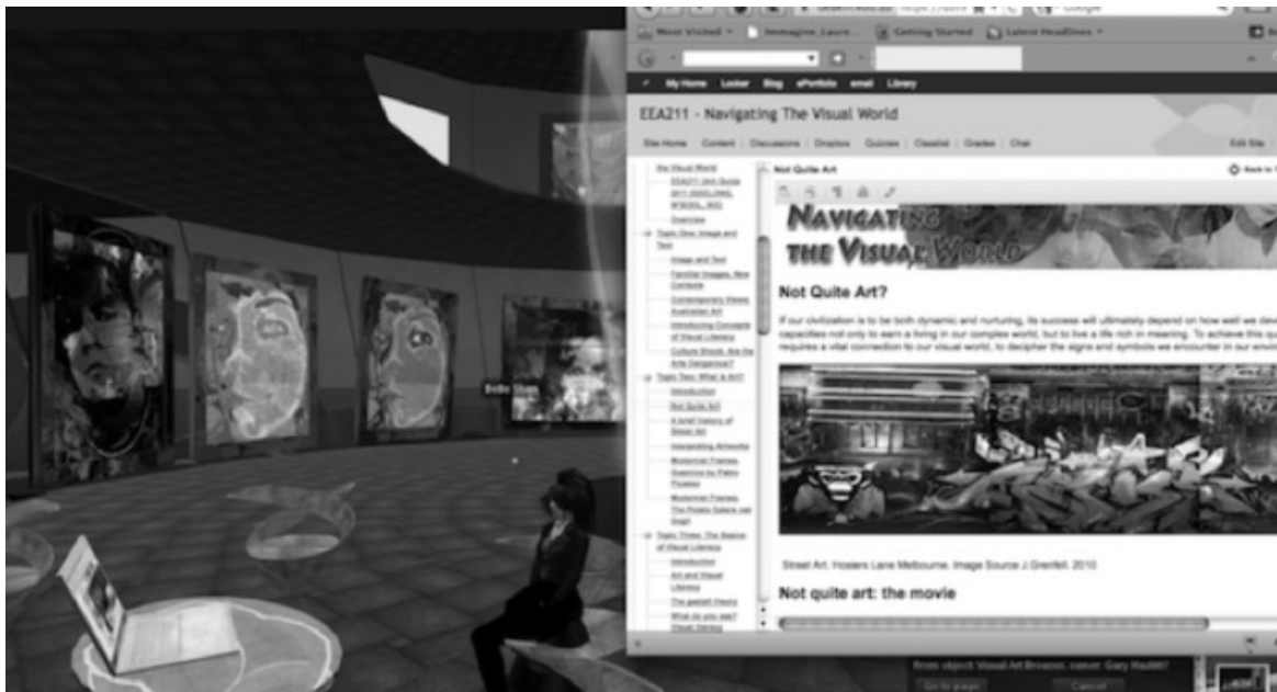
Figure 5. The learning environment: Accessing online study materials from within the virtual art gallery in Deakin arts education centre in SL 2011.

One of the central ideas in developing, this unit was to encourage students to actively contribute to the content development of the unit and to explore concepts of visual literacy in art and popular culture. What this means is to have students actively engage in knowledge creation, to question and to develop their own ideas both in making and responding to art works. The unit study materials are a beginning, providing students with a starting point to their exploration of ideas and key art concepts. Here, participatory engagement is central to the learning experience. Individual journaling participation in online discussion is part of the process that includes uploading visual and text based responses to class activities and personal explorations. Although some students were initially reluctant to participate, their confidence in using technologies grew as they engaged in dialogue with each other, looking at the images, commenting on ideas and the use of media and technique, looking at the appropriation of images and links between text and image. Students also learned to access online study materials from within the virtual environment in SL (see Figure 5).