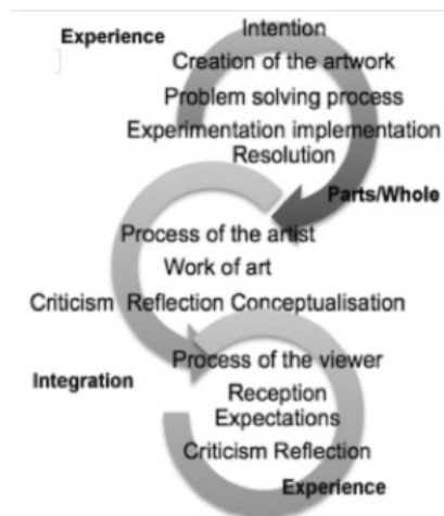
Figure 7. An interpretative narrative framework within an art making process (image reproduced with permission of Grenfell, 2011b).

The interpretative narrative research focus enabled students to explore the creative process associated with image making, individually, collaboratively and an audience. Image making experiences manifests themselves within a spiraling phenomena of problem-solving, experimentation, implementation, and resolution, where the parts integrate to form the whole experience to support further engagement with the existing artwork and which may result in additional creative work (Glass, 2008). This concept is expressed in the following diagram (see Figure 7).