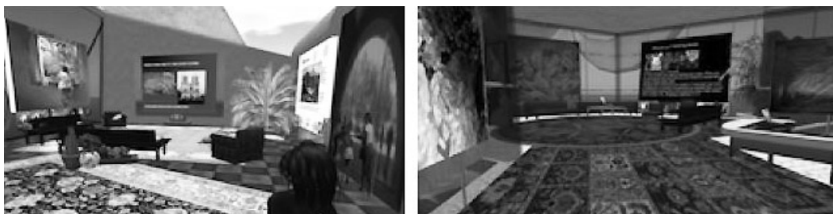
Figure 10. The teaching environment of the Deakin Arts Education Centre in SL (image reproduced with permission of Grenfell, 2011b).

carried out these in-world tasks outside of formal class times. For some, the Deakin Art Centre (see Figure 10) became a regular meeting place, where their alter ego avatars congregated before teleporting to other SL sites, returning to report their experiences to fellow classmates and educators. Mindful of social issues occasionally encountered in some SL locations, students are encouraged, to set their “home base” to the Art Education Centre before venturing away from Deakin island.