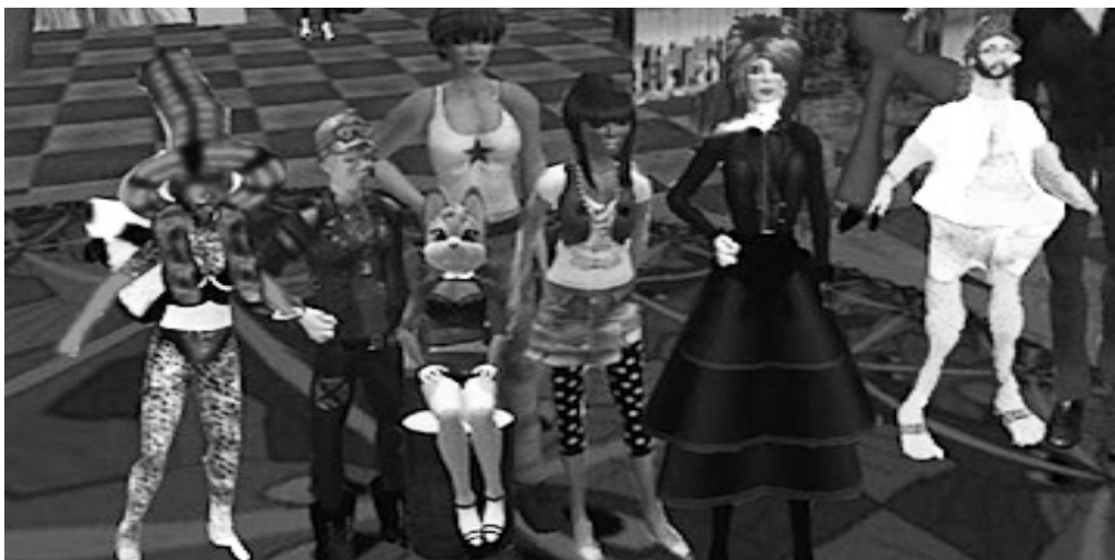
Figure 4a. Student avatars and art educator in SL.

In establishing an art education e-learning community, the idea of the centrality of the participant in the process of knowledge creation is not new. What is innovative, however, is the ability for students to engage in collaborative and active authentic learning and to construct knowledge within an augmented immersive environment. Punie (2007) contended that the collaborative engagement of participants in common or linked experiences and projects has the potential to establish communities of learners based on the perception that the more participants believe they can learn from a community by sharing their experiences, projects, and values, the more likely they are to engage and participate as active members of that community.