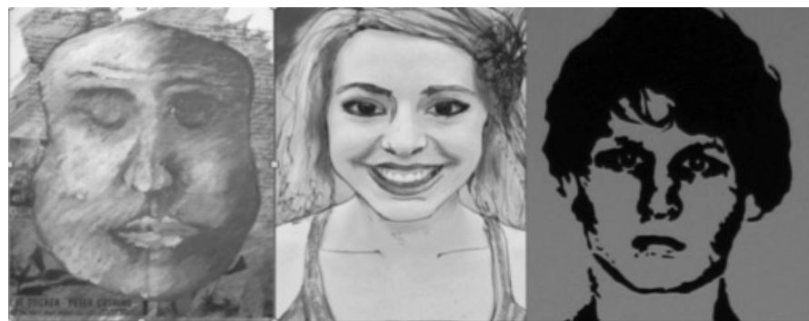
Figure 12. Students used traditional art making techniques, such as drawing, painting and print making.

In timetabled studio sessions, students explored issues of their own identity within broad societal and cultural frameworks (see Figures 11 and 12). This process encouraged frank discussion of issues relating to gender, class, and identity, and how these issues impact on individual lives and personal experience. Students selected artworks and critically examined the definition of art within historical, social, and cultural frameworks. They debated the use of irony and parody as strategies for critical social commentary and the appropriation of artworks to fuse fine art traditions and popular cultural statements. Many of their own artworks reflected these discussions. They also considered the practical roles of artists, gallery directors, and curators in the creation and presentation of the artwork to a wider real and virtual community of viewers.