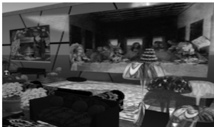
Figure 3. Student B: Studio in SL.

To live in-world, you need to develop your avatar. When you join the SL community, you are invited to choose from a number of basic avatar types. Having arrived in-world, you are invited to customize your look or appearance. A number of possibilities are available free or you may purchase clothing, skins and accessories using Linden dollars from a vendor. Shopping is addictive! (Grenfell, 2011b)