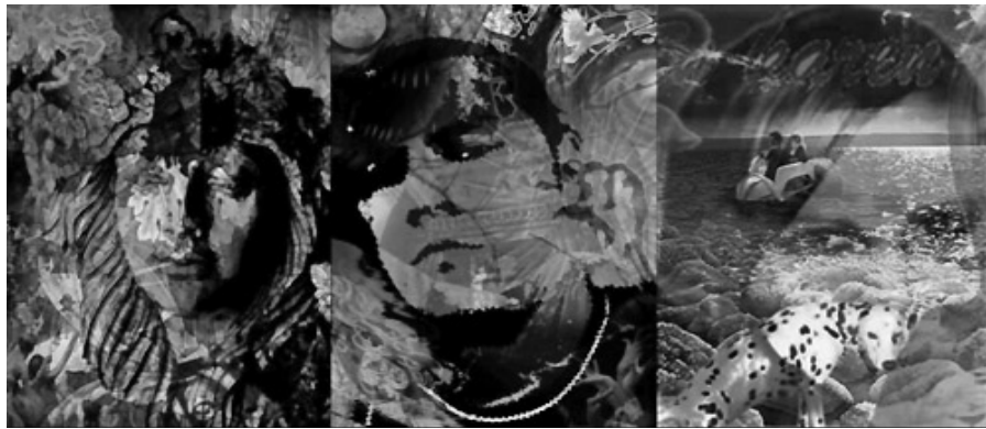
Figure 11. Student images of self using digital imaging technologies in a virtual art exhibition (image reproduced with permission of Grenfell, 2011b).