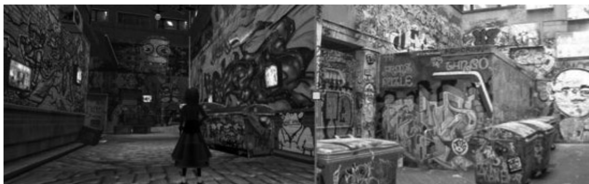
Figure 4b. Street art laneway on Deakin Island in SL (left) and student photographic report on street art located in Hosier Lane Melbourne (image reproduced with permission of Grenfell, 2011b).

Because of the asynchronous nature of working in the virtual world (see Figure 4a), students met in-world and worked on the development of the art exhibition space in the evening. The educator reported that there was a small group who met her in-world in the evening. They worked on building the exhibition for a time, then teleported to other locations, such as the street art Laneways (see Figure 4b) build in SL. On return, they reported on their experiences and resumed work, building the exhibition space. One of the most interesting aspects recorded by the educator was the social interaction between the students and the educator (Grenfell, 2011b). She observed that this collaborative relationship continued to develop during on campus studio sessions.