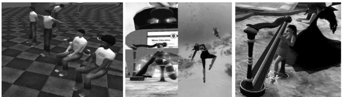
Figure 2. Orientation activities in the sandpit located in the virtual arts education centre.

Students were also introduced to the Deakin online study environment, D2L and after acquiring an avatar, they began to participate in exercises in the virtual world of the Deakin Art Education Centre in SL. As students mastered new skills in the 3D virtual environment (see Figure 2), they worked together to create new scenarios, including personal studio spaces and a group exhibition space. They considered as potential collective courses of action to develop deeper thinking processes and alternative perspectives in particular social, cultural, and educational contexts (Grenfell & Warren, 2012). Throughout this process, students were encouraged to record their experiences. They took screen shots of in-world activities (see Figure 3), uploading them in the online discussion area within D2L and recording their experiences in their visual journals.