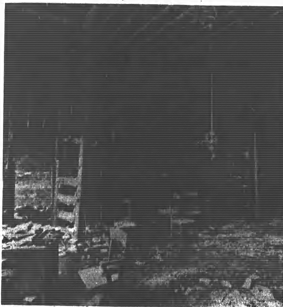
Classroom, books, and supplies suffer damage from both fire and water.