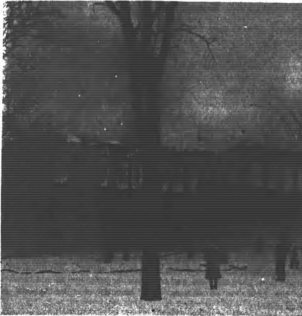
Roof fires may gain much headway before being detected.