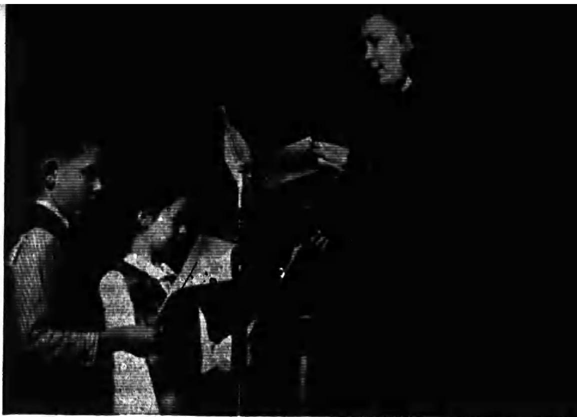
EARLY EXPERIENCE WITH THE "MIKE"

on controversial subjects are severely criticized. The fact that a teacher belongs to a certain religious denomination, race, or social group may occasionally make him unpopular with, or wholly unacceptable to, some persons in the community. The interest of parents in the teachers of their children is entirely natural, and it has its rewards as well as its penalties. Persons who enjoy public life usually feel that the advantages of public service outweigh its disadvantages. In any case, an applicant for a position should ascertain the nature of any unusual restrictions through inspection of contract forms, correspondence with employers, and in other ways before accepting employment. Usually the meeting of reasonable community expectations is helpful to the teacher in more ways than one. Arbitrary restrictions may often be ignored. In some cases—and these are not very common—the teacher will be unable or unwilling to meet the demands of certain communities and may wish to seek a position elsewhere.