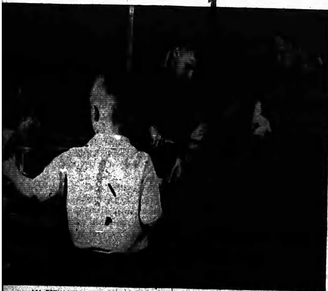
AN ESTIMATED 21,690,000 CHILDREN WERE ENROLLED IN ELEMENTARY SCHOOLS IN 1946-47

The physical conditions in and around the school buildings vary from simple, or even crude surroundings, as in backward one-teacher schools, to the extensive conveniences of modern school