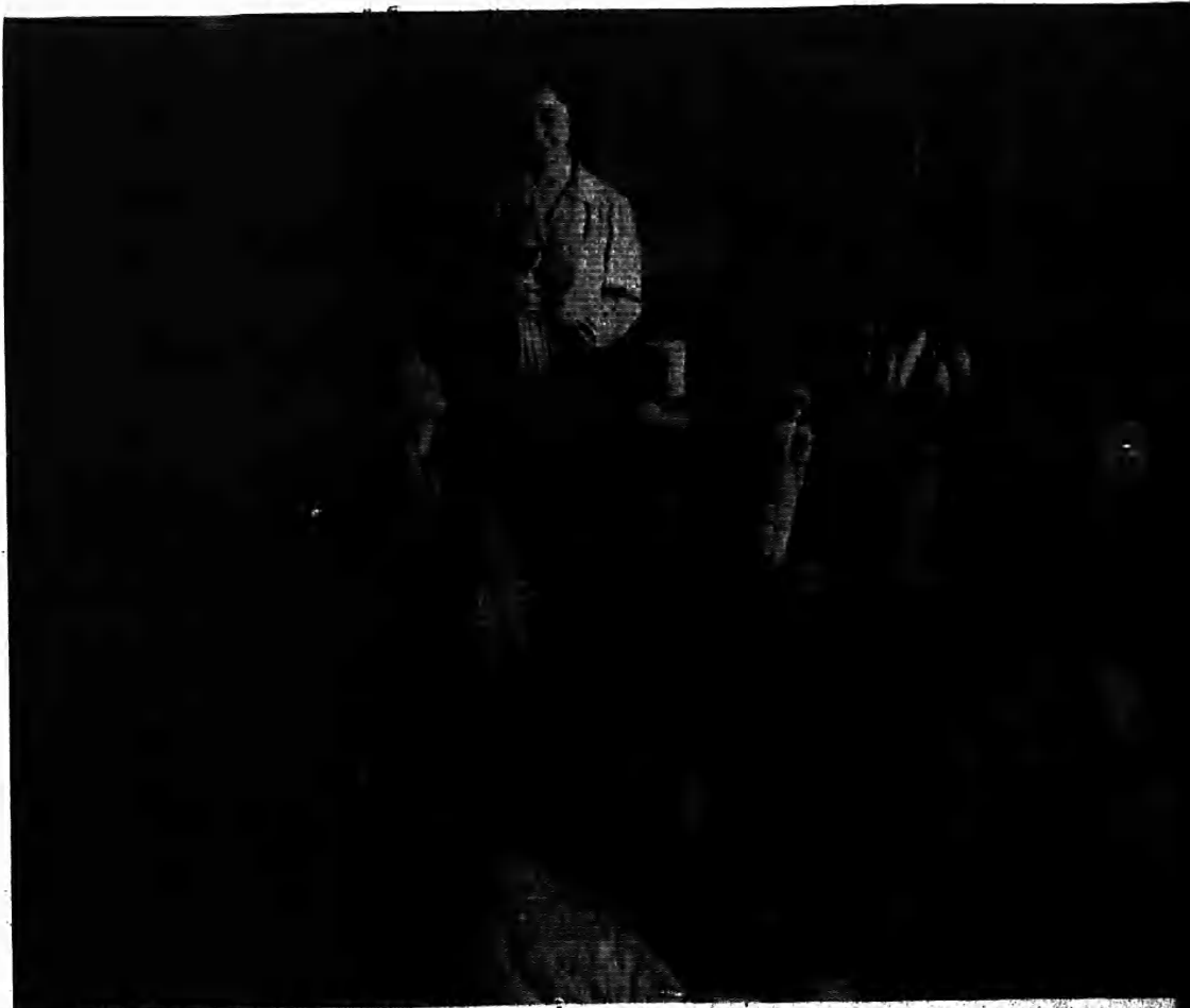
ASSISTING PUPILS TO LEARN IS A SATISFYING EXPERIENCE

The minimum age requirement for certification is usually 18 years, but school officers prefer to employ somewhat more mature persons as teachers. Before the war about one-third of the cities