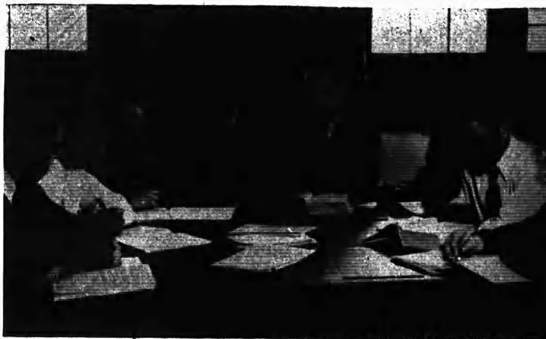
SERIOUSNESS OF PURPOSE IS EVIDENT AROUND SUCH CONFERENCE TABLES

The larger city school systems and the colleges employ numerous professional, technical, and other specialized staff members in addition to those previously listed, including vocational and educational counselors, deans of students, physicians, nurses, dietitians, attendance officers, building superintendents, research directors, and librarians. Not included in table 1 are thousands of educational specialists and officers in business, industry, and government.