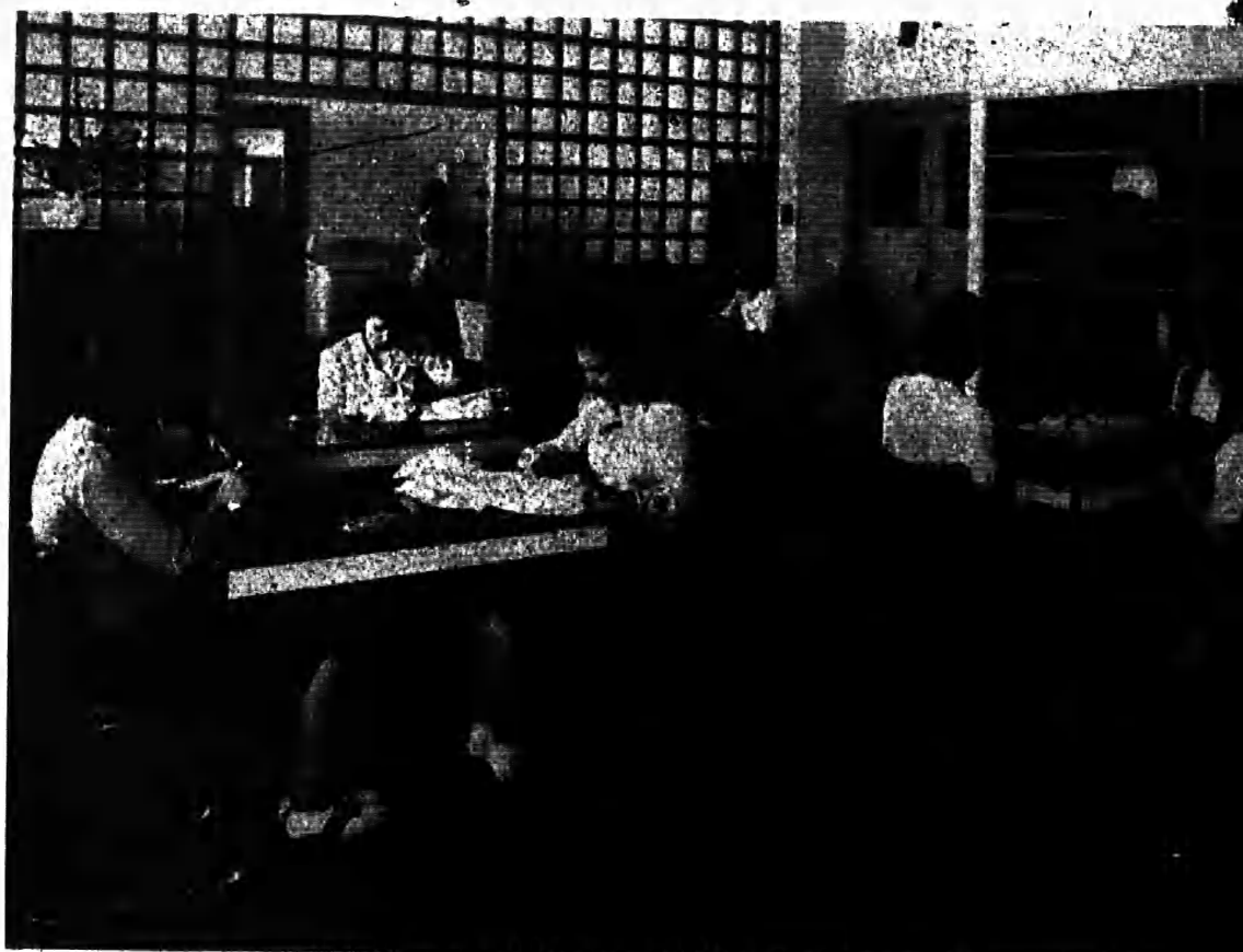
PREPARATION FOR TEACHING IS GOOD PREPARATION FOR LIVING

Possibly more than in any other profession, teachers continue their schooling after they enter paid employment. Teachers who wish to raise the grades of their certificates or keep them alive, who wish to secure their first degrees or advanced degrees, who wish to secure promotion, or who wish to keep abreast of the constant changes in education, all take college courses including courses given in extension classes during evenings and Saturdays, attend summer sessions, and secure other forms of in-service preparation (5). One teacher in every four or five annually attends a