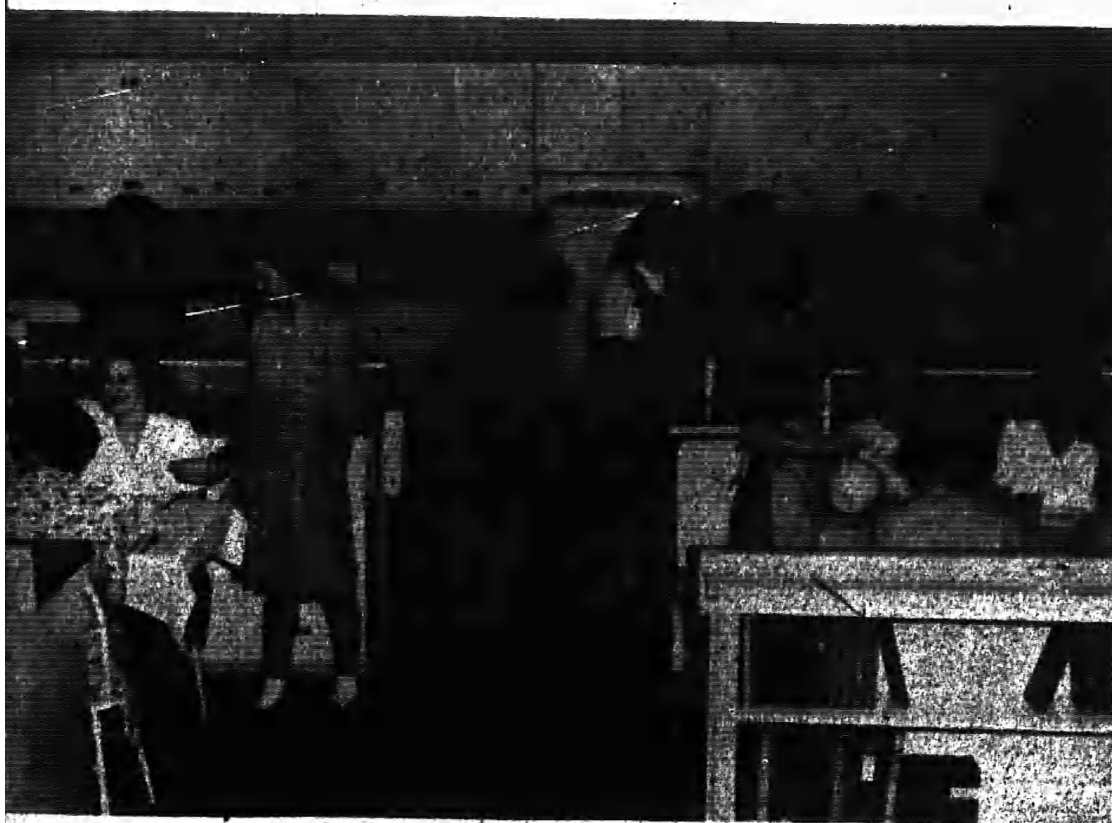
THERE IS CONSTANT DEMAND FOR TEACHERS TRAINED IN HOME MAKING

In the secondary school most beginning teachers must be prepared to teach two or more subjects, such as a combination of history and English or mathematics and science. It is chiefly in the larger high schools that teachers are scheduled to give instruction in a single subject; such schools in normal times commonly