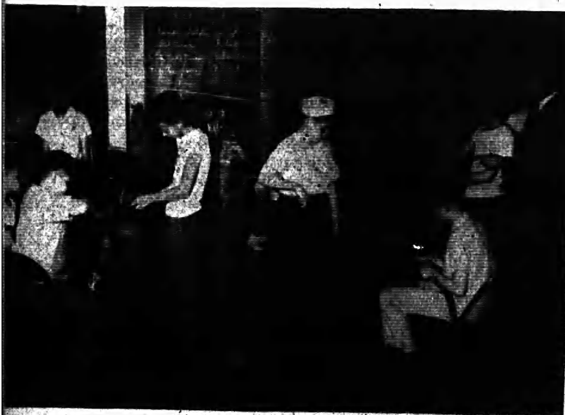
A FAMILIAR SHOP SCENE IN MANY SCHOOLS

Teaching activities differ considerably among the several grades and types of schools. Classroom instruction, for example, varies with students of different ages and attainments. As students