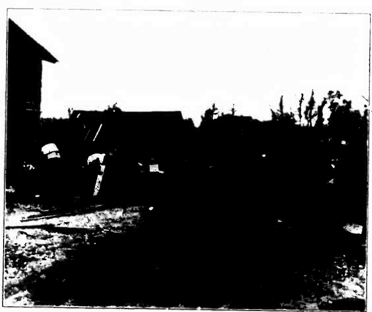
B. BACK YARDS IN THE WHITEWATER SCHOOL DISTRICT.