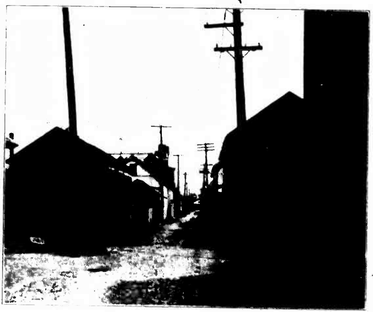
4 AS A. TO WINE RESIDENTIAL SECTION OF RICHMOND IND