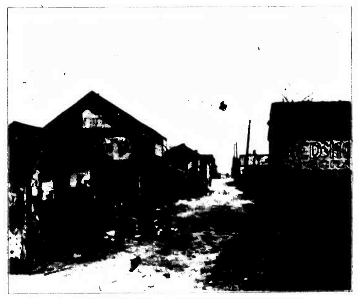
4 PICHMOND IND ASSELN SPOM THE RAILROAD