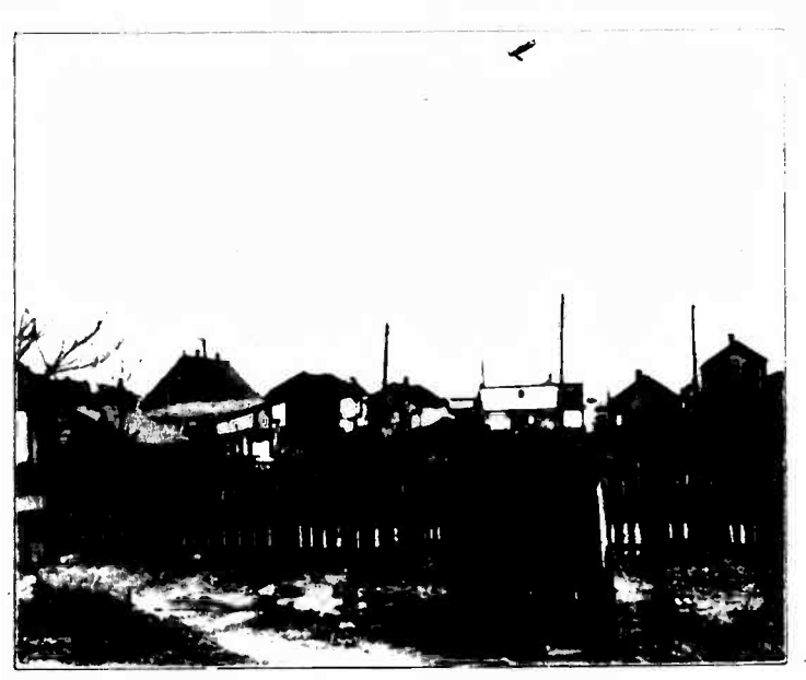
B. ANOTHER VIEW FROM THE RAILROAD.