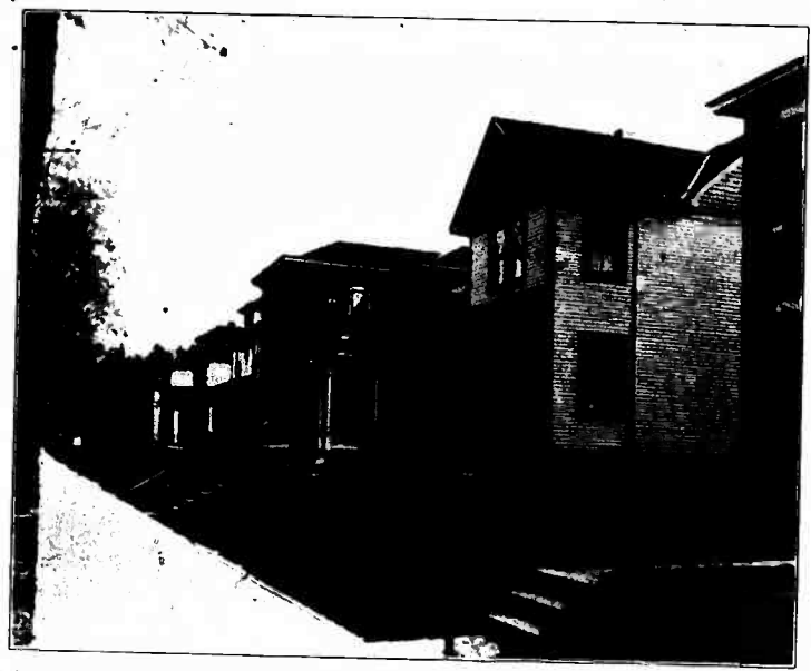
4. VINES AND SHRUBBERY WOULD IMPROVE THE APPEARANCE OF THESE HOMES