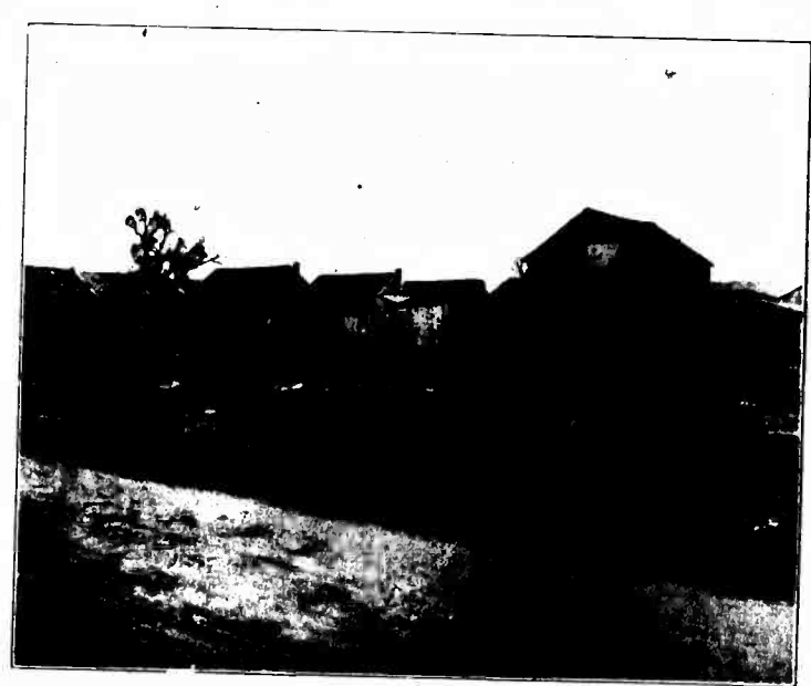
B. THESE BACK YARDS COULD EASILY BE GARDENS.