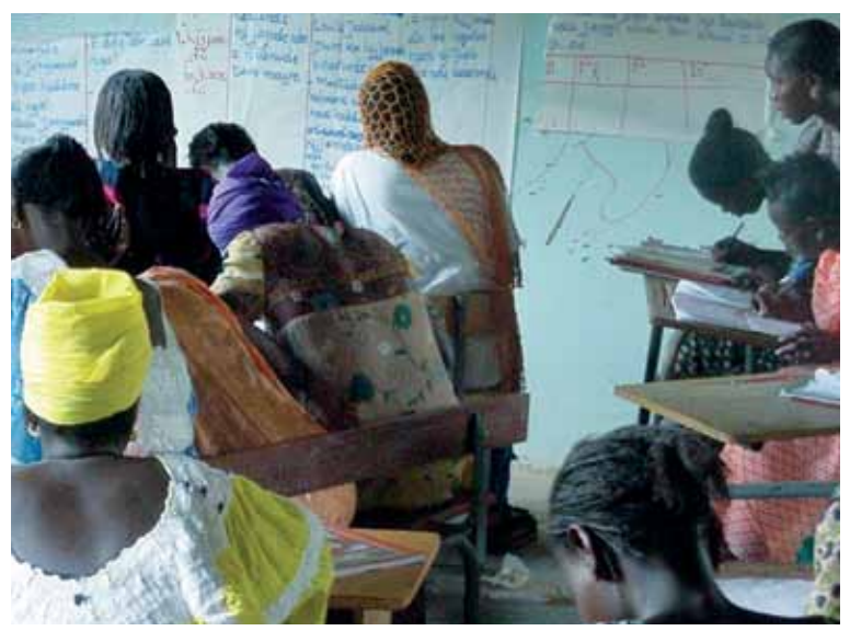
Top left: Reading and writing class, bilingual education Niger Top right: Parents teaching children, Uganda Left: Class for girls, Senegal