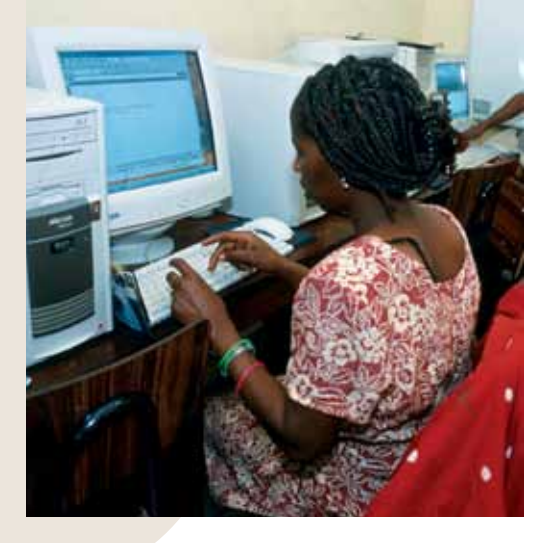
Core questions 1. The impact of mother-tongue-based multilingual education on social and economic development