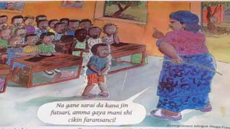
us très bien que tu veux aller pisser, mais dis-le d'abord en bon français j

The following example makes the case for education in a language in which teachers can teach competently. If teachers instruct students in a foreign language, they must be trained in second language teaching and learning didactics. Macdonald (1990) found that the switch from one medium of instruction to another in year 5 to be an important factor in higher drop-out and repeater rates by the end of year 5. Apart from reasons such as the barriers created by school fees, the students simply lacked the linguistic proficiency in the foreign language of instruction. When year 5 students switched from Setswana to English at the beginning of year 5, they had exposure to only 800 words in English but needed 7,000 to be able to follow the year 5 curriculum. Teachers are aware of this fact and often use a familiar language instead, but the education system does not change to overcome or reward this creative behaviour to remedy the situation.