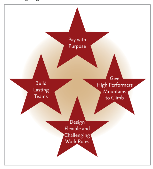
FIGURE 1. Shooting for Stars — Four Key Strategies for Retaining High Performers

When companies tie compensation to performance, high performers stay . . . An organization's stars stand to gain rewards commensurate with their higher contributions under differentiated pay systems. As a result, these rewards most strongly affect the turnover rate for high performers. For example, a meta-analysis of 55 studies of performance pay in various private sector settings suggests that performance-based rewards improve retention of high performers.<sup>18</sup> In addition, a study of more than 5,000 employees at a large petrochemical organization demonstrates a significant relationship between pay, performance, and turnover — high performers