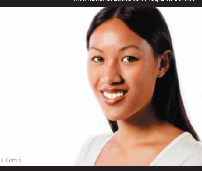
Technological Innovation and Cooperation for Foreign Information Access Program