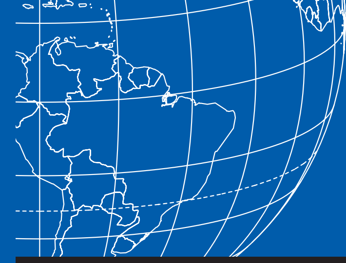
U.S. Department of Education International Education Programs Service