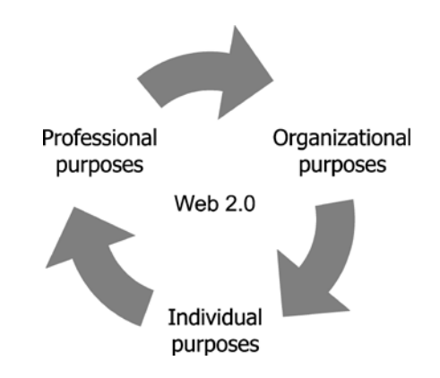
Figure 2. Levels of needs analysis for individual purposes, for organizational purposes and for professional purposes

Developing the idea of Vossen (Vossen, 2009, p. 38) on the use of Facebook or MySpace for private applications, and LinkedIn or Xing for professional applications, or Twitter for both, use of the social dimension of Web 2.0 is differentiated into the use of the social dimension of Web 2.0 for individual purposes, for organizational purposes and for professional purposes as shown in Figure 2.