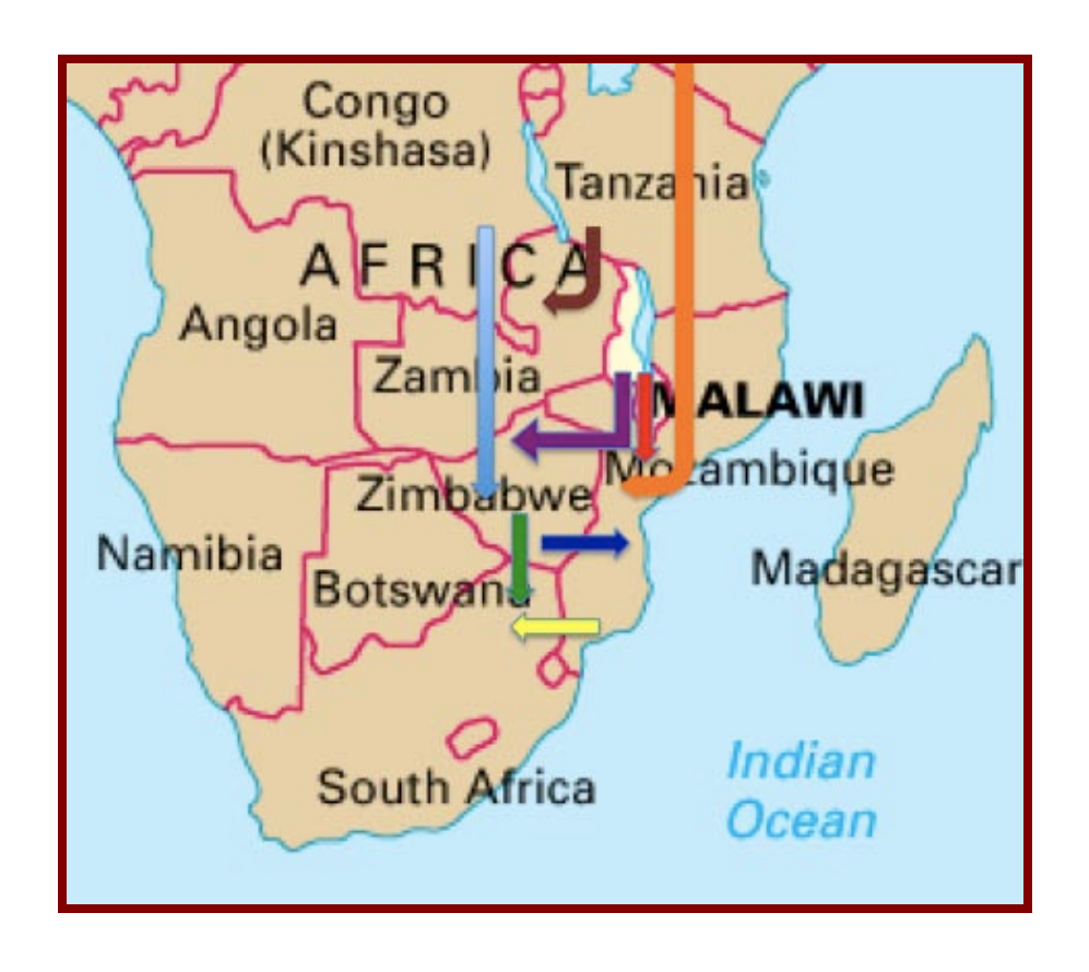
Figure 2: Migration paths in southern Africa.