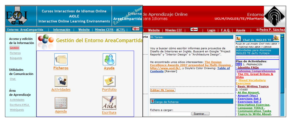
Figure 5 AIOLE sets of services for learning

features to help learners take control and manage their own learning: using WebWriter 2.0 for editing tasks, activities and rtf/html files on the web, using AWLA integrated to practice writing and listening with multimedia management, and using the e-portfolio edition (Figure 6) and management, where the learners can design their own learning path, their curriculum vitae or language passport, and their e-dossier, with access to scanned, uploadable certificates and pictures, audio and video files.