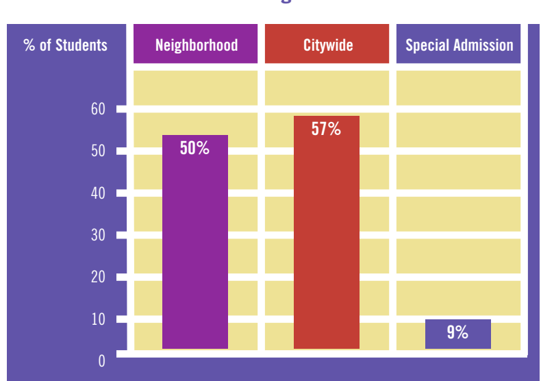
Figure 3.1 First-time Ninth Graders Enrolled in Intensive or Strategic Math

Our qualitative research revealed that charter high schools were likely to be using double dosing for ninth graders as well, as three of the four charter schools in our sample were providing double dosing in math and English to their ninth graders.