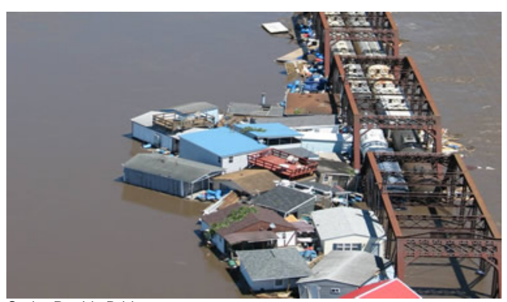
Cedar Rapids Bridge