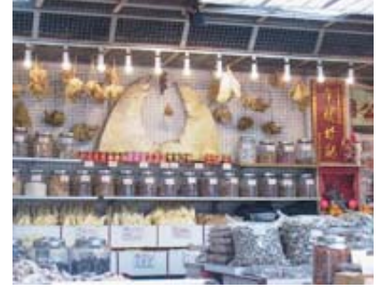
Taking stock. Genetic tests are helping reveal which sharks are killed for their fins.

confiscated 900 kilograms of dried shark fins from a ship headed for Asia from the United States.