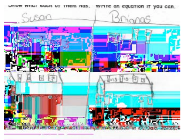
Figure 1. Nancy

Each of the students in the class produce their written account of the problem. Although most of the children in this class of 18 students made iconic representations for the problem (78%), one third of them included an equation in their representation and more than one third (39%) included a letter in their representation, to stand for one or more of the unknown values.