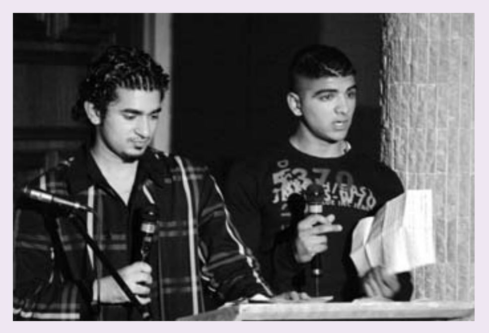
Members of Youth Action were runners up in the post-16 citizenship music competition.

'As a volunteer with Youth Action, I'm getting involved in local youth projects on issues such as bullying, crime and drugs. The most important part for me is to learn new things on the various issues but also about getting my friends and local young people on positive development projects that will open their minds and for them move on to better things for their future.'