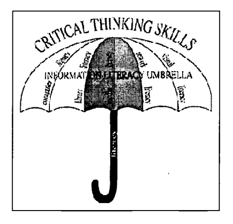
Information Literacy Umbrella

Remember when our campuses started emphasizing computer literacy? Well it just is not enough. There is library literacy, media literacy, network literacy and visual literacy. Even before that, we have to be concerned about basic reading skills. There are two national literacy organizations in the National Forum on Information Literacy because being able to read without being able to find the information needed to read only has you half way there. So we have to start with the basic literacy, and then information literacy brings all the other literacies together as a major component in the critical thinking skills. It's the old Liberal Arts concept: people have to be prepared for lifelong learning to be successful in the world.