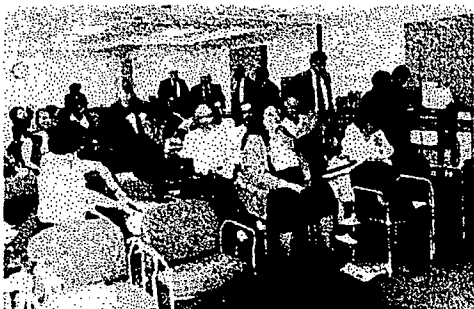
Figure 1: Fall 1997 faculty training session

Through the help of a Mathematics Mediated-Learning Committee-at-Large (Vice President of Academic Affairs, Executive Deans, Deans of Faculty, Area/Divisional Deans, Department Head of Mathematics, Mathematics Faculty, and Academic Systems Inc.) within a seven-month period (July 1, 1997 - January 1998) the stage was set to begin teaching MA01, MA07, and MA27 using this approach. Job descriptions for the professional assistants were developed. Two three-day faculty-training sessions were held with over 110 faculty attending and over 70 completing the training. The Director of Instructional Research developed an outcome assessment plan that was approved by the Committee-at-Large. College-wide syllabi were agreed on and tests were developed. New initial rosters were developed containing students mathematics placement and achievement information. New final grade reports were created and College software was altered to handle the reporting of the grades. Student Advisement software needed to be altered to reflect the seamless approach being taken. Counselors were trained on the meaning of the new approach in mathematics. The first semester is completed! The faculty at SCCC are much more technologically literate. We will begin to see the initial outcomes by January 1999.